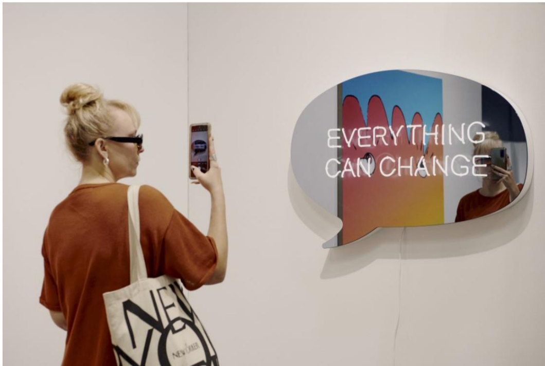
A visitor at the Armory Show, 2022.