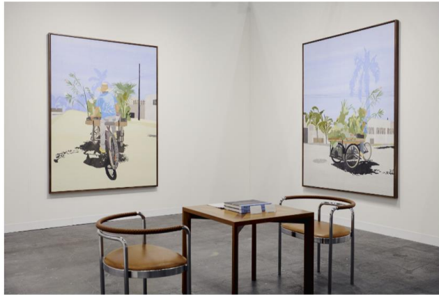
Installation view of Hugo McCloud paintings at Sean Kelly.