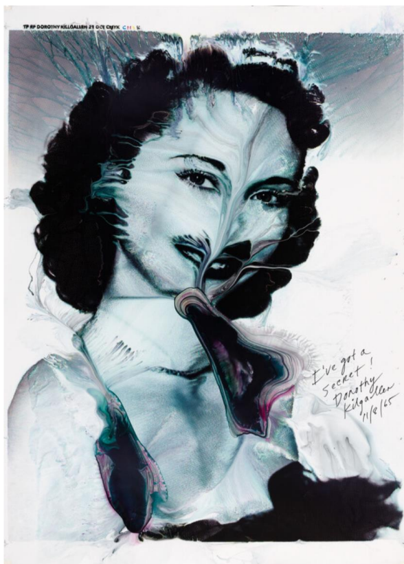
Richard Prince, I've Got A Secret (2022).

$200,000 each: Three unique Richard Prince dissolved silkscreens at Two Palms