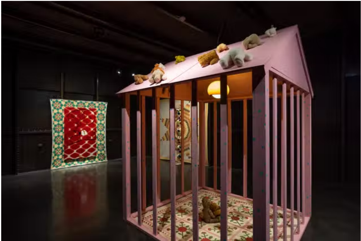
Installation view: Hadi Fallahpisheh: As Free As Birds at Goldsmiths Centre for Contemporary Art.

This first institutional solo exhibition in Europe for Hadi Fallahpisheh is now enjoying an extension. Meaning, that if you'd meant to get down to Goldsmiths CCA to see the Iranian artist's work, there is still time.