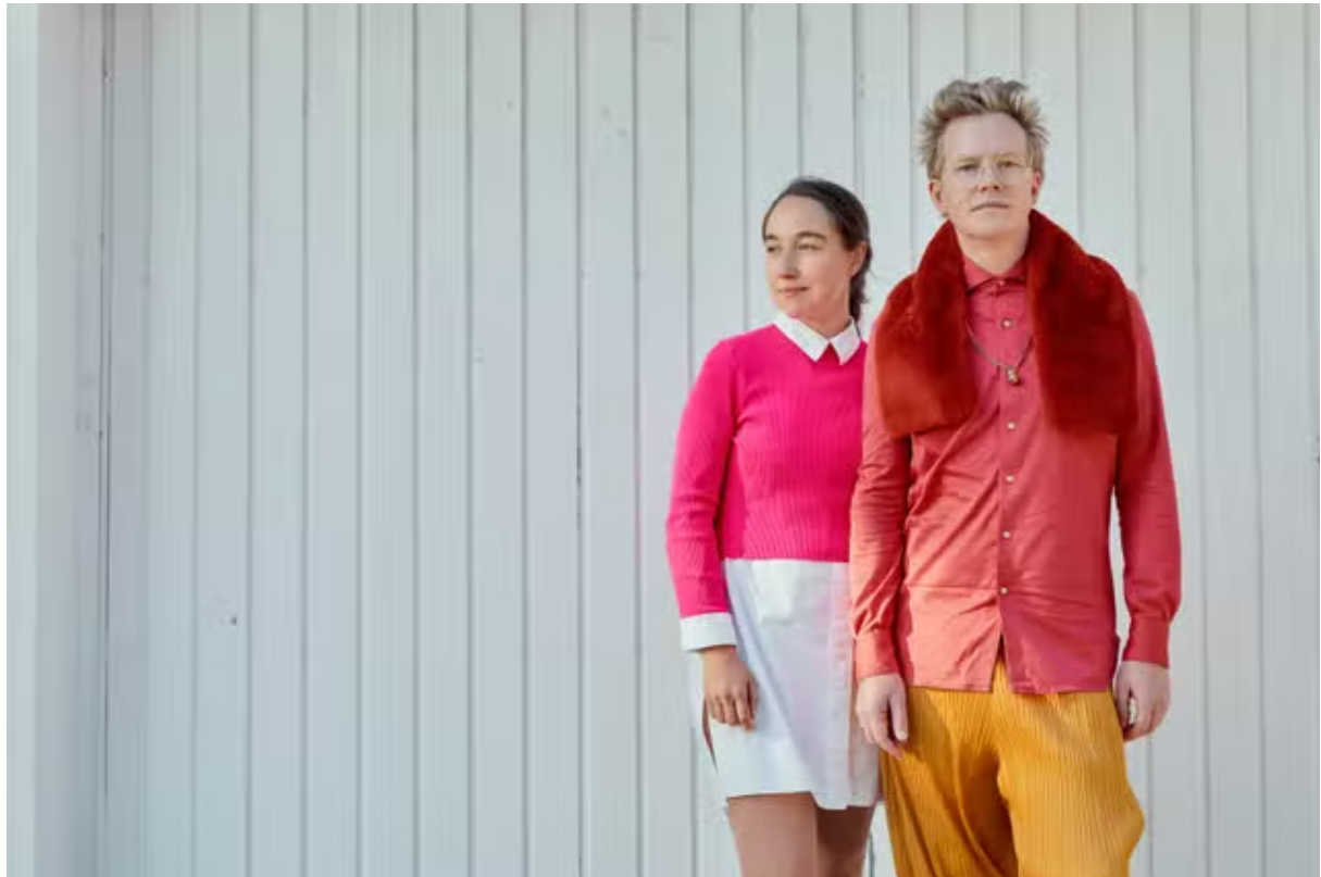
2021.