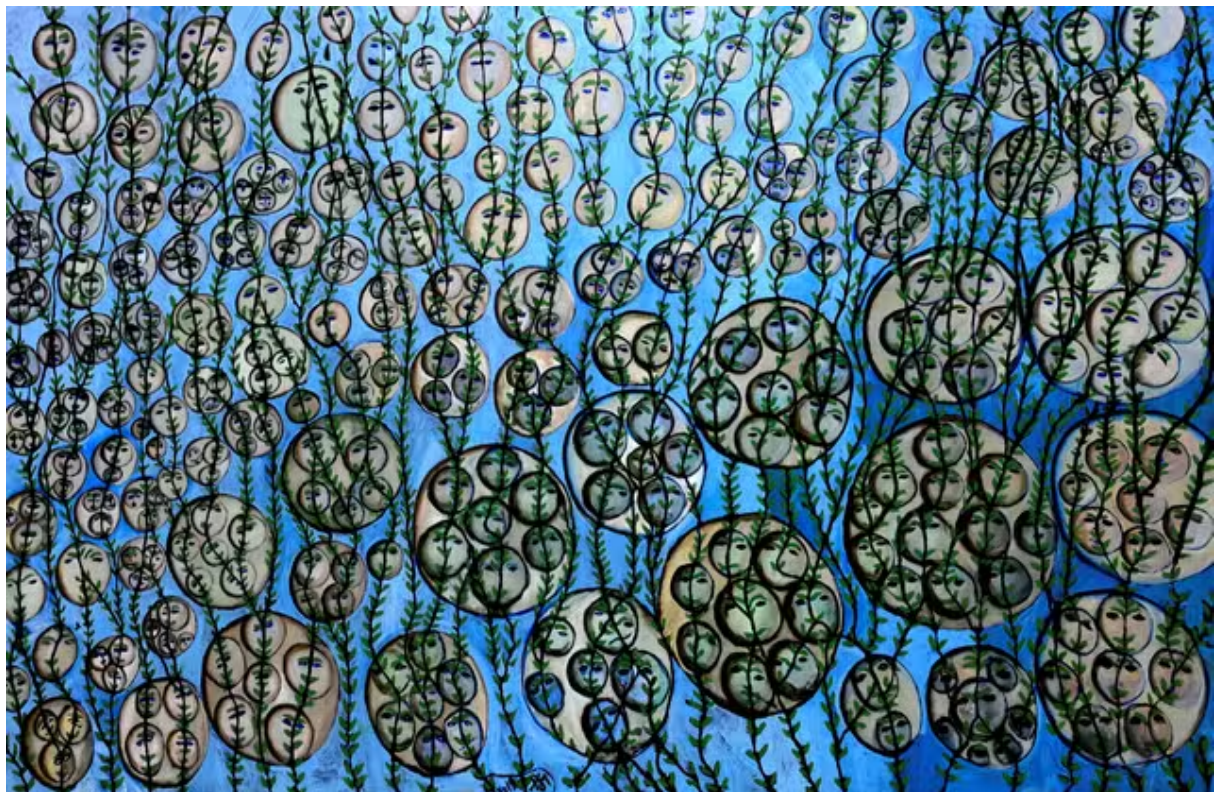
Blues for the Martyrs, 2022. Courtesy the artist.