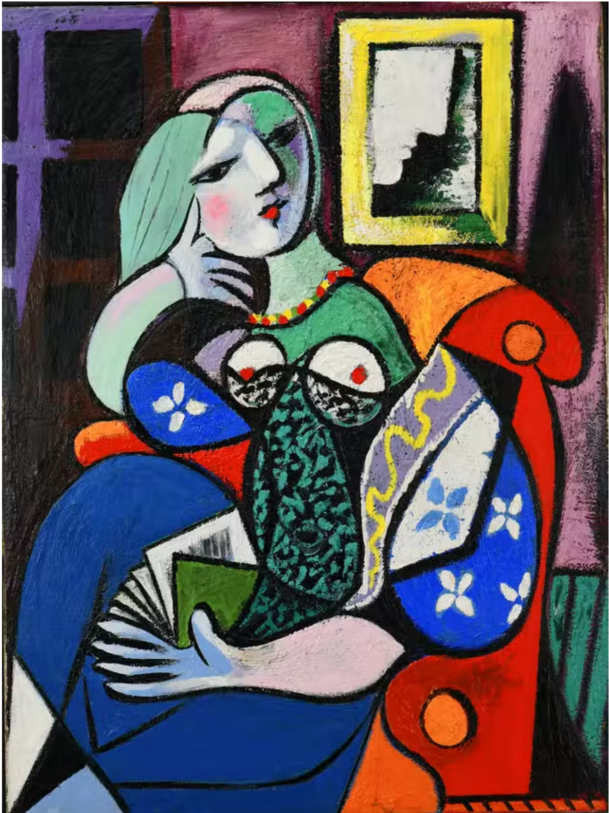
Woman with a Book Pablo Picasso 1932, The Norton Simon Foundation

Woman with a Book is one of Picasso's most famous paintings, but did you know that it was based on a painting called Madame Moitessier by the 19th-century classical artist Jean-Auguste-Dominique Ingres? Or that Picasso frequently referenced Ingres' portrait for over a decade after first encountering the work?