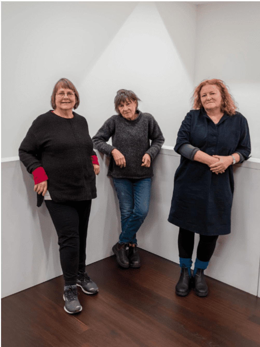
Phyllida Barlow, Alison Wilding, and Rachel Whiteread, 2022.