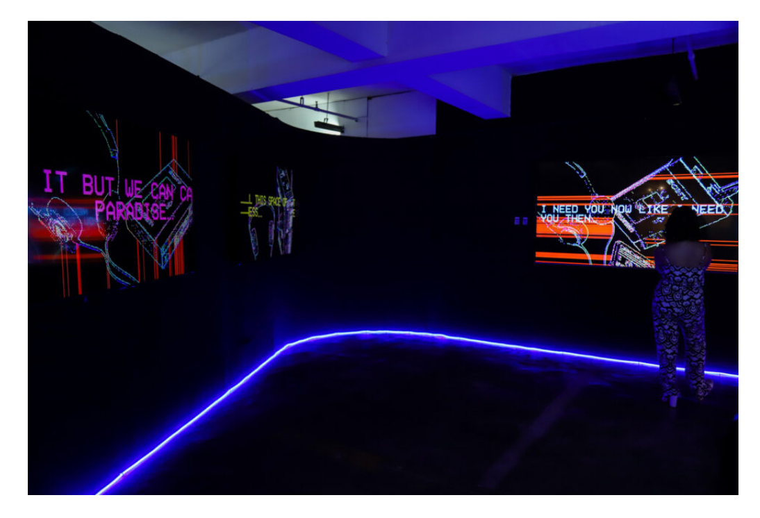
Excel Palanque 4/10