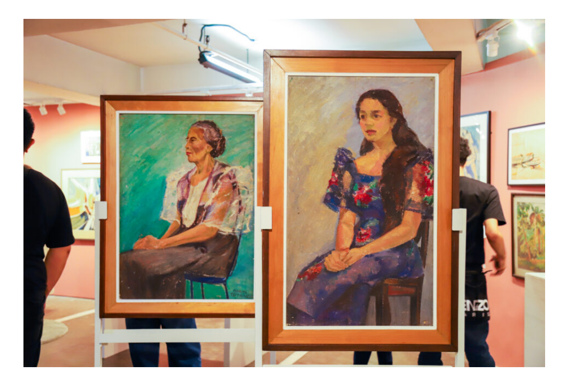
Excel Palanque 8/10