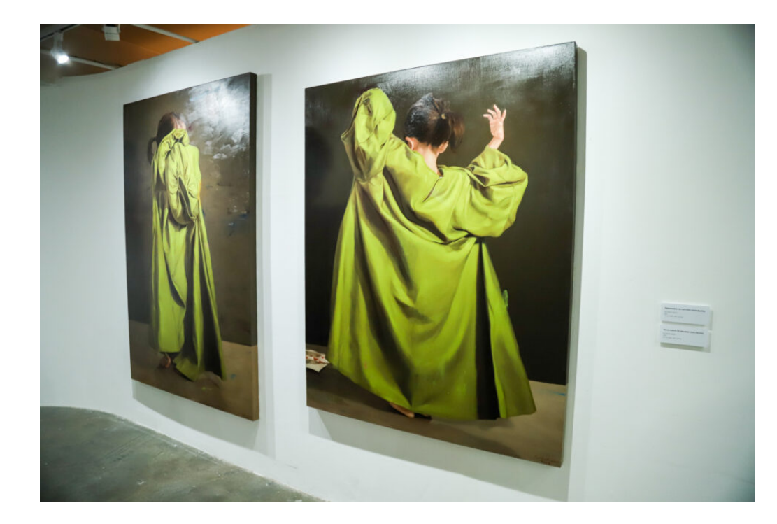
Excel Palanque 9/10