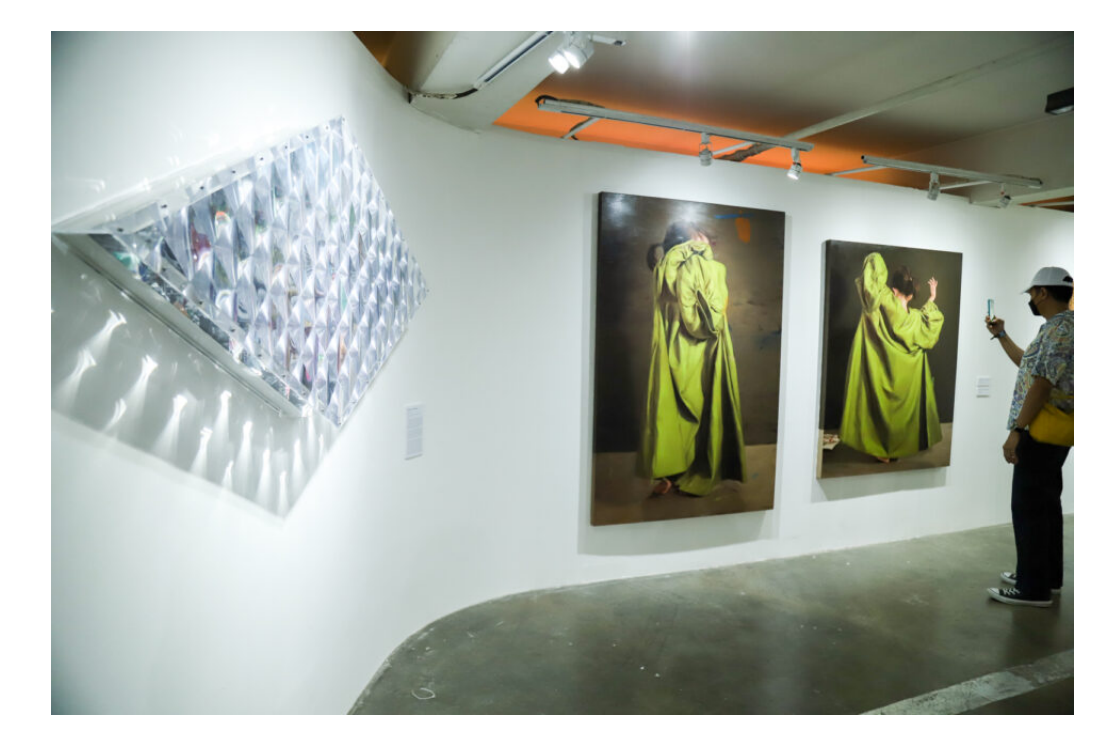
Excel Palanque 5/10