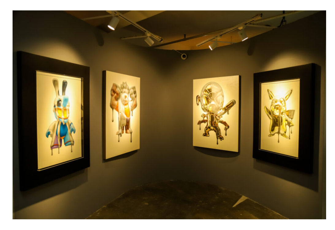
Excel Palanque 1/10