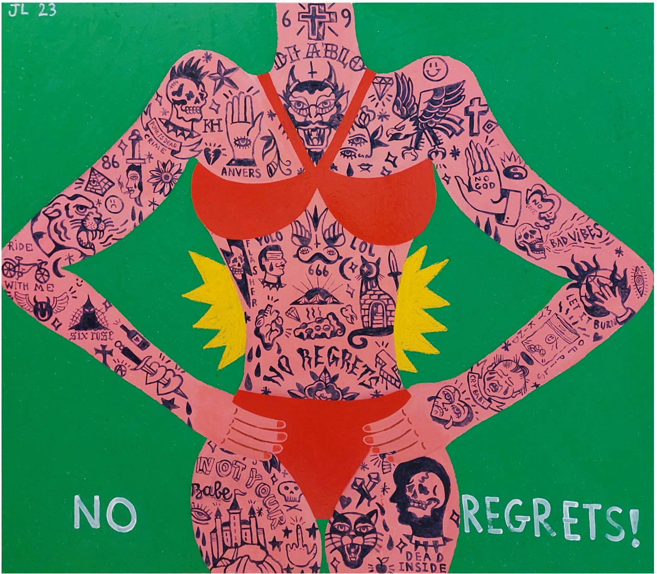
Joachim Lambrechts No regrets (female torso on green background) , 2023 Enamel paint, oil stick and spray paint on canvas 140 x 160 cm 55 1/8 x 63 in