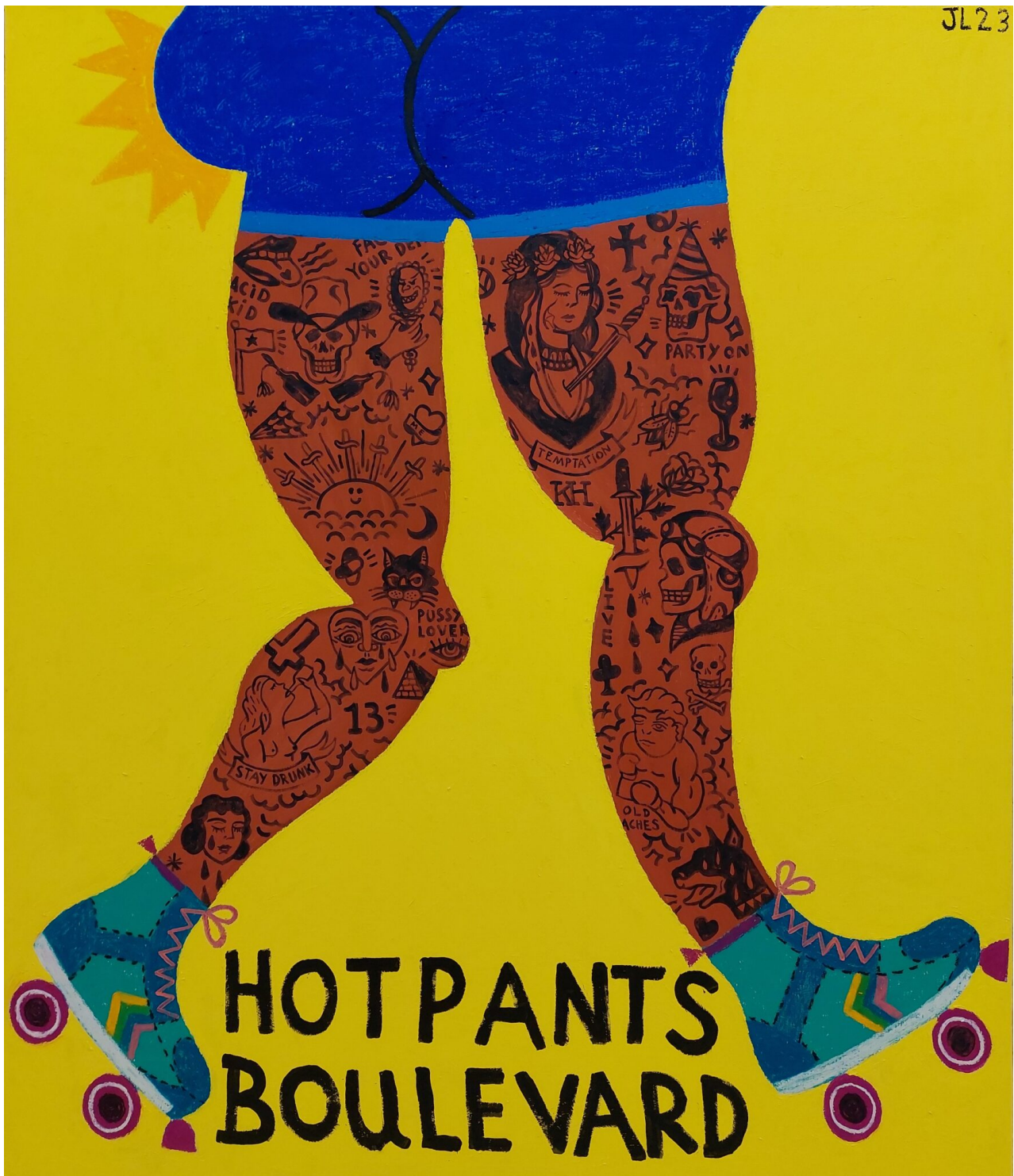
Joachim Lambrechts Hotpants Boulevard , 2023 Enamel paint, spray paint and oil stick on canvas 140 x 120 cm 55 1/8 x 47 1/4 in

For Lambrechts, the absorption of tattoos into the mainstream is no bad thing: they are a form of accessible, wearable art and in many ways, these bold, dynamic paintings are a celebration of unbridled self-expression and creativity. And yet, they also ask us to consider who or what is driving the choices that we make and how we create narratives about ourselves and others.