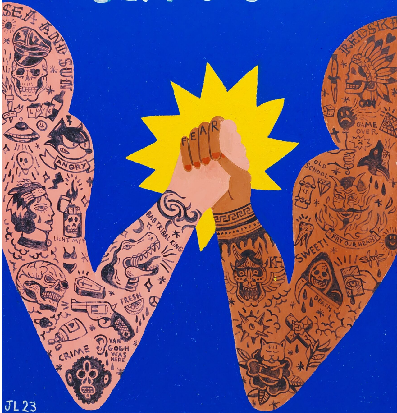
Joachim Lambrechts Sea & Sun , 2023 Enamel paint, spray paint and oil stick on canvas 140 x 120 cm 55 1/8 x 47 1/4 in

It seems that today, surrounded by an abundance of information, material and influences, people are more than ever searching for themselves and a sense of belonging,