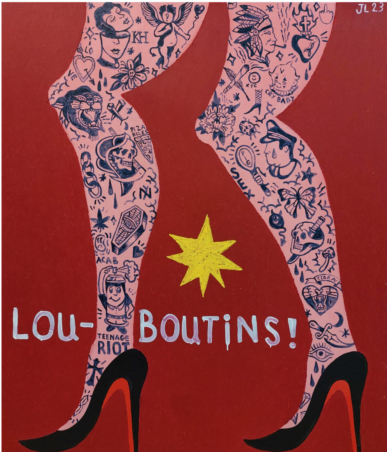
Joachim Lambrechts, Louboutins , 2023 Enamel paint, spray paint and oil sticks on canvas 140 x 120 cm 55 1/8 x 47 1/4 in

This is perhaps most clearly expressed by the painting Louboutins , which depicts two tattooed women's legs walking in high-heeled black shoes. The painting uses humour to poke fun at consumerism (the brand name is split apart by a hyphen to suggest a particular pronunciation and punctuated by an exclamation mark), but at the same time, it's easy to imagine it being adopted as an advertisement for a luxury brand which is looking to appeal to a generation of younger, edgier consumers.