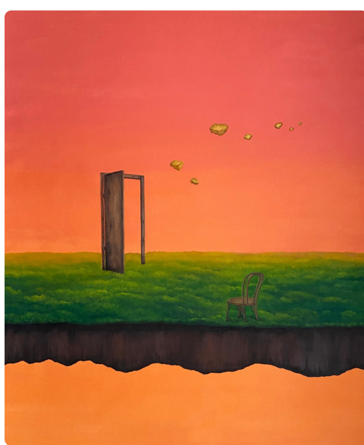
Drifting through an open door I, 2022/23 on canvas mounted on board, 95 x 69 cm | 37 1/2 x 27 in

Another recurring motif are pieces of gold that form a trail in the sky, drawing the eye into the distance. In all of Terjuman's paintings gold makes reference to El Dorado , the legend of a golden city that has bewitched people for centuries with its promise of imaginable riches. However, she explores El Dorado not as a place or hopeless quest for material wealth, but as a state of mind that enables positive thinking. In Drifting Dreamscape VI , for example, one of the darker, more melancholic scenes, which depicts a cream sofa on the edge of boggy wasteland, the gold provides both a light source and a pathway to something beyond the present moment.