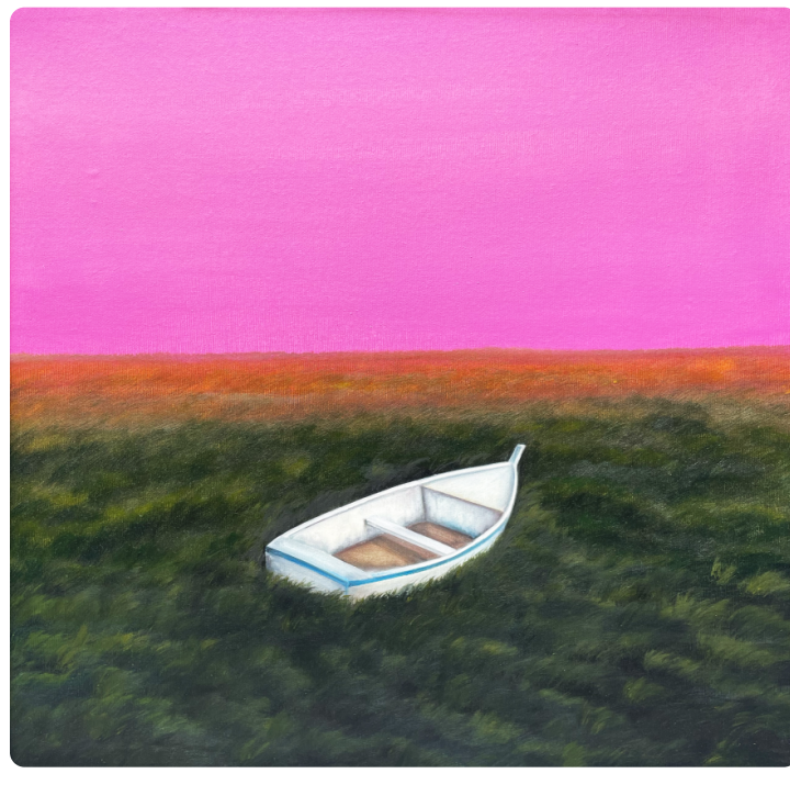
Drifting into oblivion, 2022/23 on canvas mounted on board, 60 x 60 cm | 19 1/2 x 24 in

Floating rocks tied together by string, trails of gold, a bicycle in a grassy field, a deserted swimming pool, an open door. For Houda Terjuman , life is made up of visual symbols that she collects and paints into exquisite dreamscapes that reflect on the passage of time and stories of migration. This latest series of delicate paintings, presented in Glide Through Evanescent Lands , her second solo exhibition at Kristin Hjellegjerde Gallery , is her most personal yet, inspired by her own experiences of dislocation and her continual search for balance.