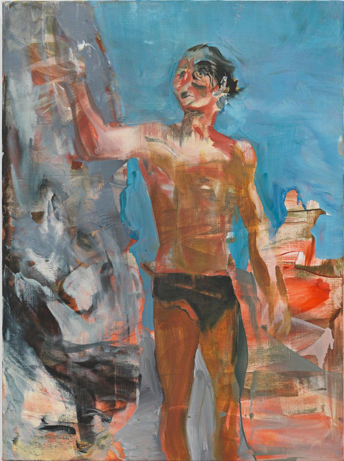
'Untitled' (2016) by Cecily Brown. Copyright Cecily Brown, courtesy the artist and Thomas Dane Gallery

In recent years, Cecily Brown has expanded the scale of her works to fill ambitious spaces such as Blenheim Palace, but this show celebrates the beauty of small things, with a display of 40 of her perfectly formed paintings.