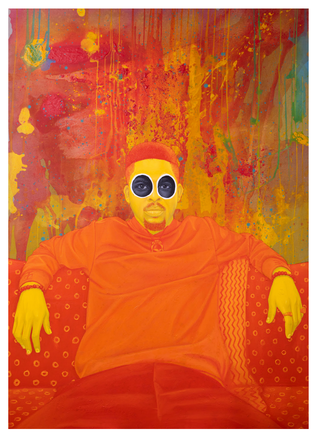
KEN NWADIOGBU, EMPIRE STATE OF MIND, 2023 Oil and Acrylic on Canvas 210 x 150 cm 82 5/8 x 59 in Copyright The Artist

<u>Ken Nwadiogbu</u> – Fragments of Reality opens for Frieze Week at Kristin Hjellegjerde Gallery, London Bridge on Saturday 7th October 2023.