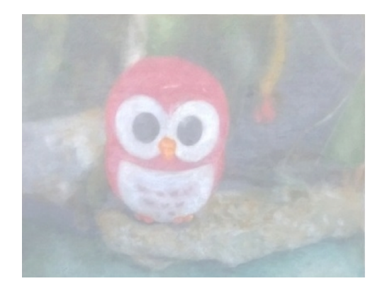
Anatidaephobia, Kristin Hjellegjerde Gallery