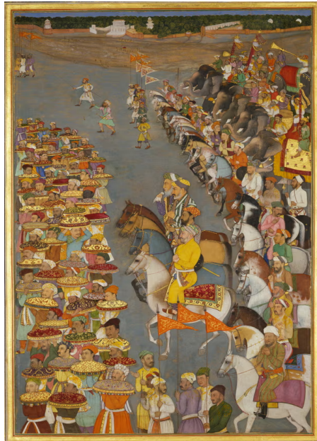
Bearing gifts... The Delivery of Presents for Prince Dara-Shukoh's Wedding, c.1640. Unknown artist, Padshahnamah.