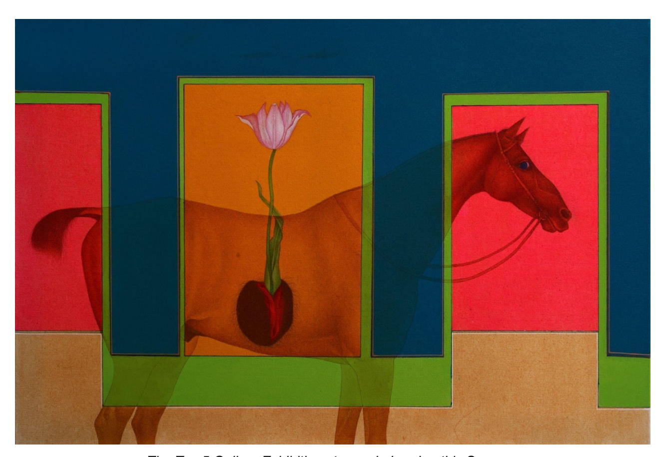
The Top 5 Gallery Exhibitions to see in London this Summer

Tabish Khan the @LondonArtCritic picks his top 5 exhibitions to see in London this Summer. Each comes with a concise review to help you decide whether it's for you. If you're looking for more exhibitions check out his photography choices where all 5 remain open to visit.