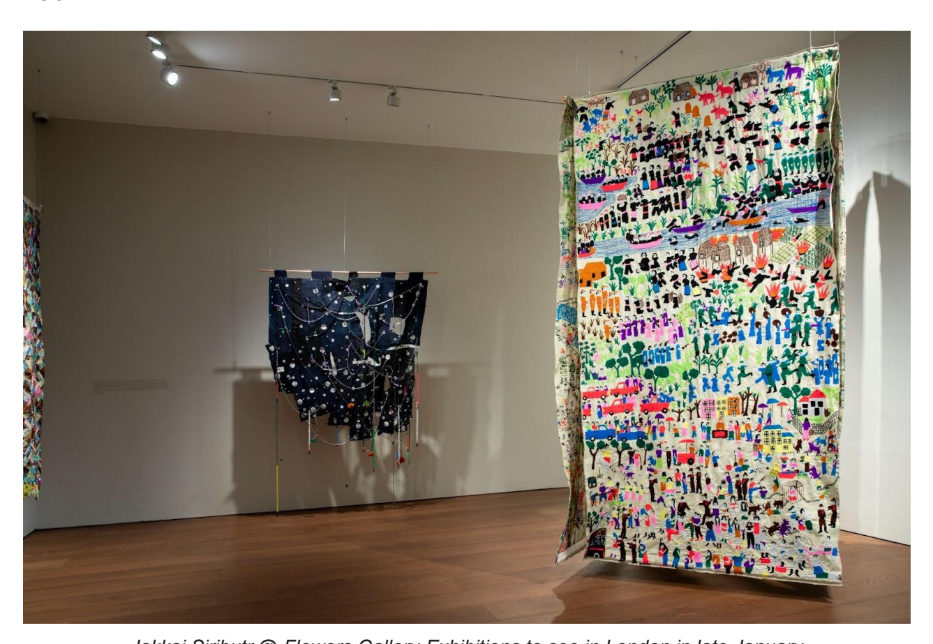
Jakkai Siributr @ Flowers Gallery-Exhibitions to see in London in late January

Tabish Khan, <u>the @LondonArtCritic</u>, picks his top 5 exhibitions to see in London in late January. If you're after more shows, <u>check out last week's top 5 where</u> all remain open to visit.