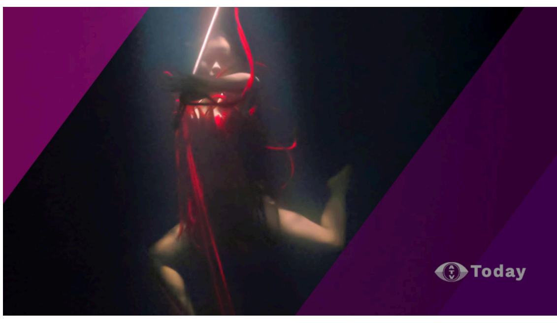
Needle Dance Underwater film still