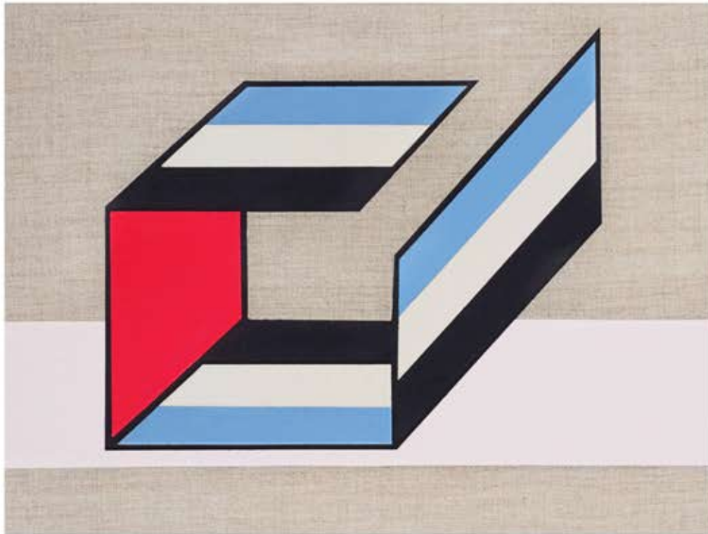
Sinta Tantra, On Being Blue A Philosophical Enquiry (No. 7_3) , 2015, Tempera on linen, 160 x 127 cm

11 Sep — 12 Oct 2015 at Kristin Hjellegjerde Gallery in London, United Kingdom