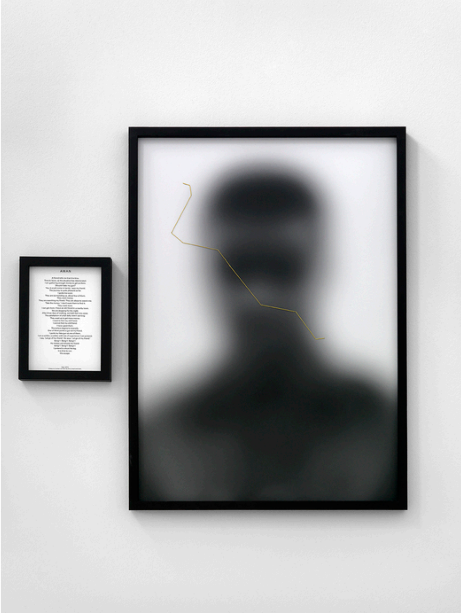
Aida Silvestri Aman / Aman poem , 2014 Gicl  print on paper, 84.5 x 60cm / 25 x 17.7cm.