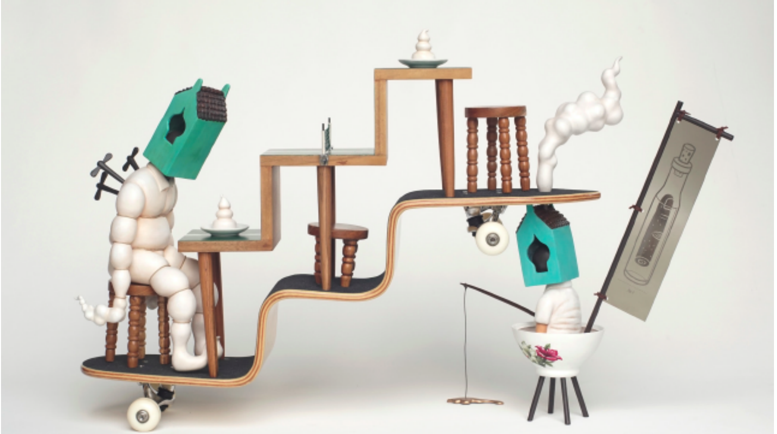
Indieguerillas, The Dialectic , 2015, Resin sculpture with acrylic painting, wooden skate and table, metal and fabric, 73 x 25 x 90 cm.