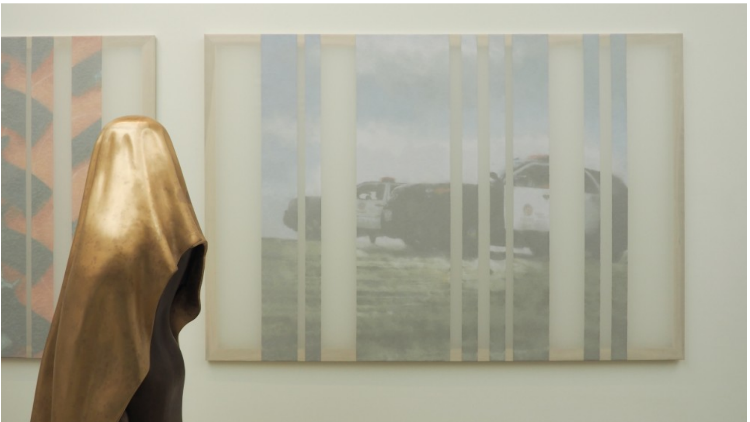
Kristin Hjellegjerde installation view, START 2015