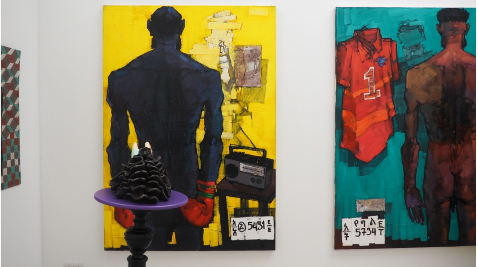
Kristin Hjellegjerde installation view, START 2015