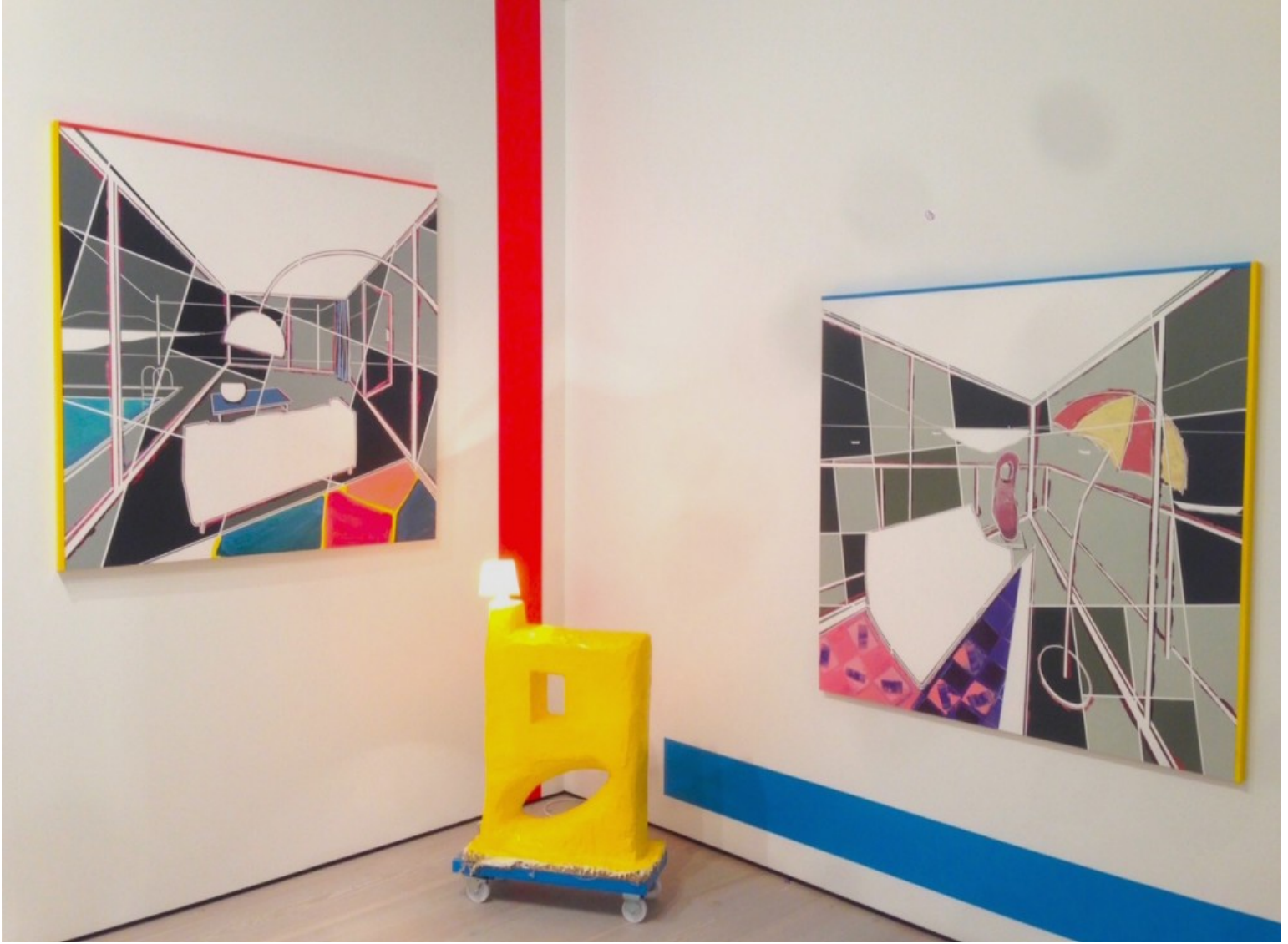
Installation view, l'étrangère , START 2015. David Ben White.