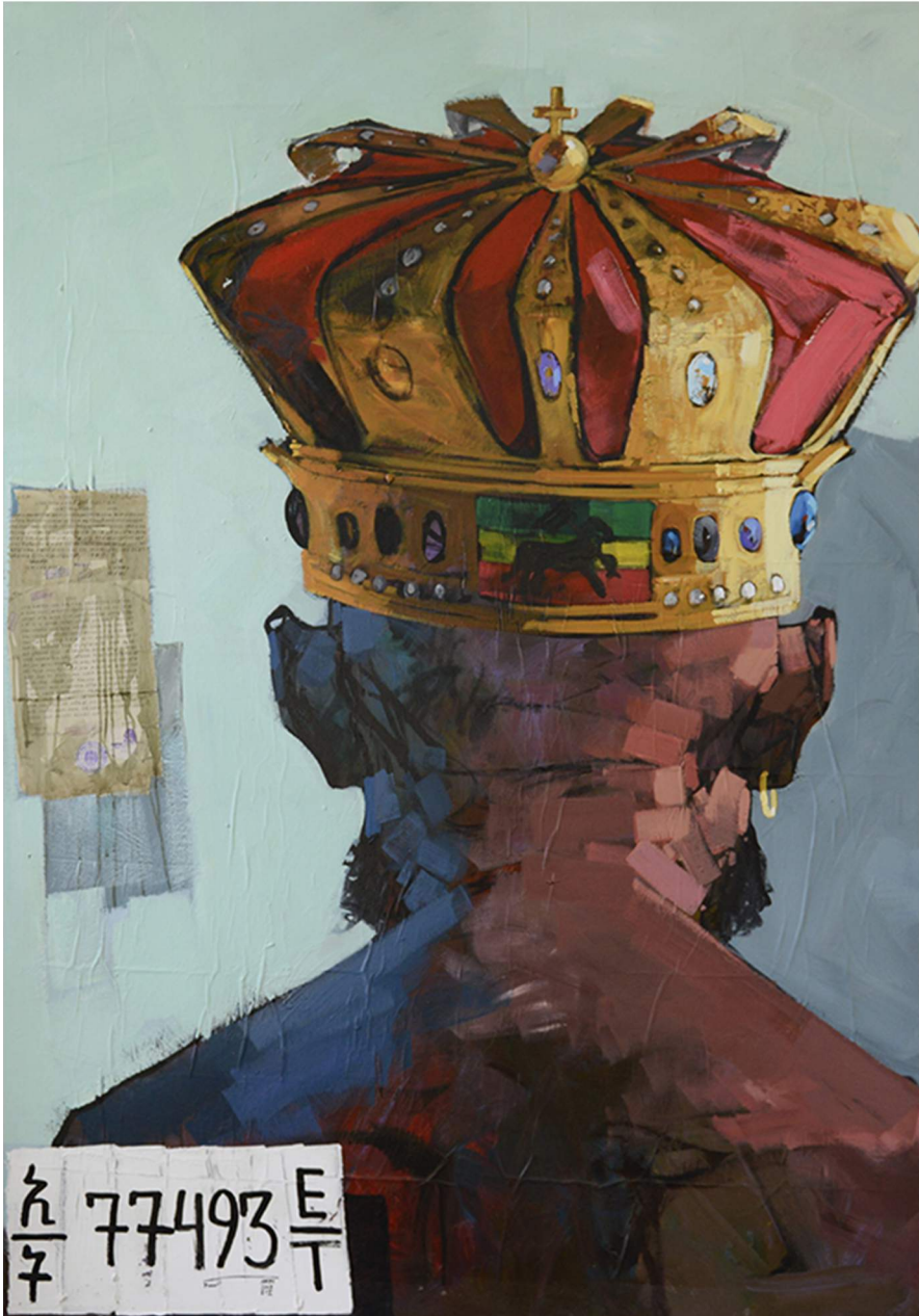
Dalit Abebe No.2 Background 36, 2016, acrylic and collage on canvas, 200 x 140 cm

FAD caught up with London gallery Kristin Hjellegjerde ahead of their showing of Ethiopian artist Dawit Abebe at VOLTA NY.