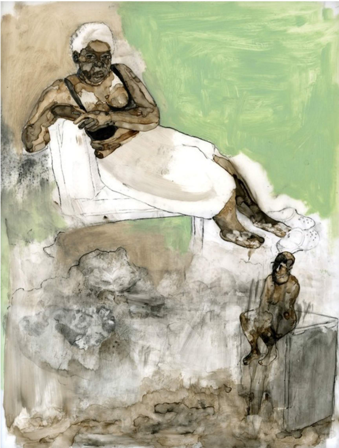
The Capture Series, 2010.