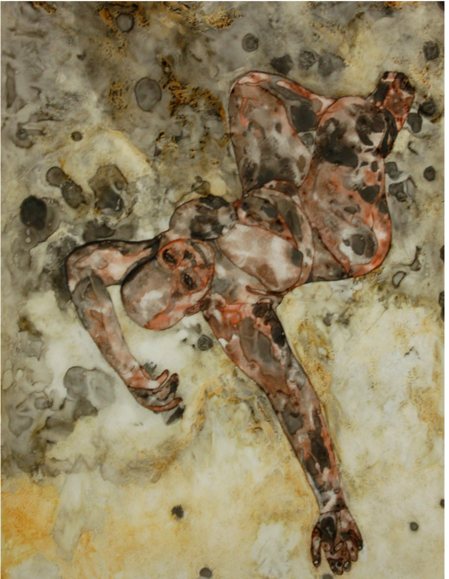
The Capture Series, 2015.