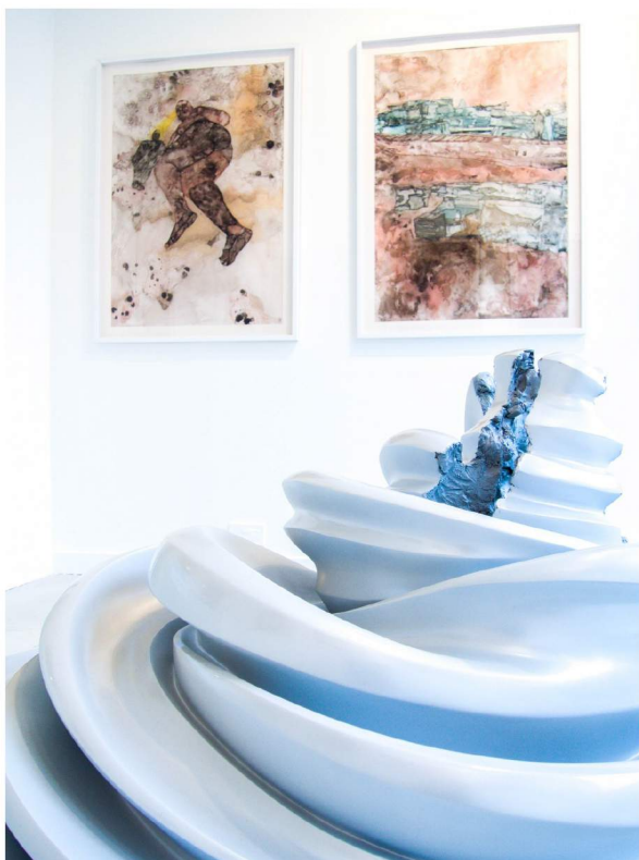
Installation view Florine Demosthene