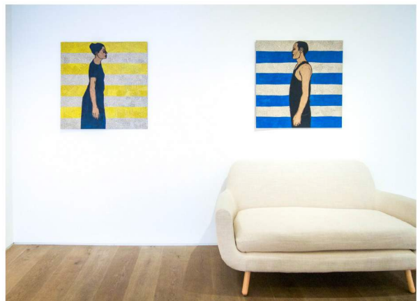
Installation view Ephrem Solomon