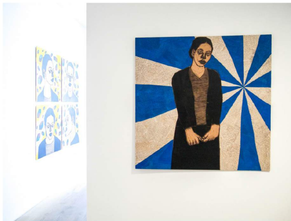
Installation view Ephrem Solomon

'Ephrem Solomon: Life vs Time' and 'Florine Demosthene' are showing at Kristin Hjellegjerde until 30 April