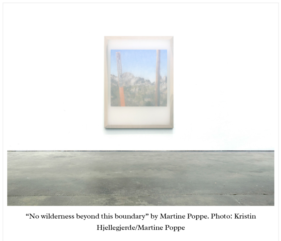
“No wilderness beyond this boundary” by Martine Poppe.

Images of cars, signposts, highways and flat and desert landscapes, all obscured as if by fog. The works of Norwegian artist Martine Poppe are familiar yet, somehow, removed. The exhibition Crinkled Escape Routes and Other Somewhat Flat Things combines Poppe's pale and ephemeral aesthetic with blurred images from the American wilderness, as seen along the country's long rural highways. Crinkled Escape Routes and Other Somewhat Flat Things consists of works assembled from images shot along the iconic Route 66, and takes the viewer on a journey through landscapes.