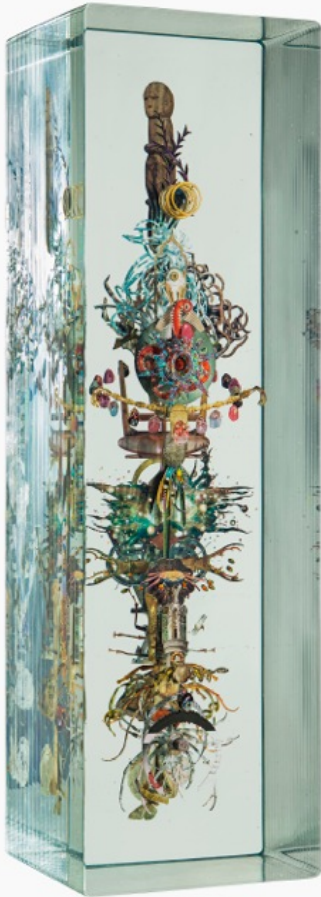
DustinYellin Totem04 2015 Glass, collage and acrylic 39 x11.5 x10.5 inches