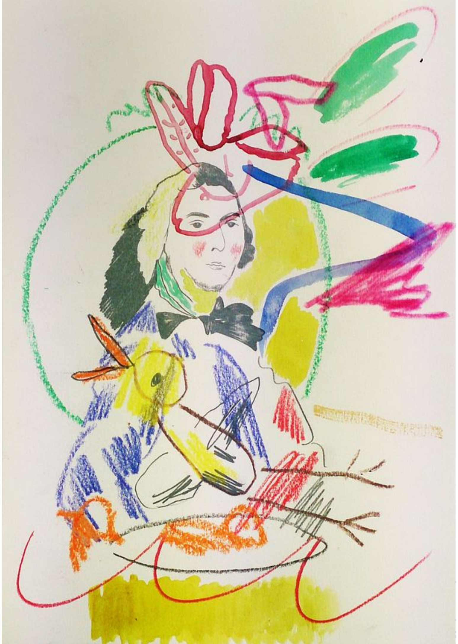
Jon Pilkington, Untitled (Less candy, more protein series), 2016, watercolor, graphite & crayon on paper, 21 x 15 cm