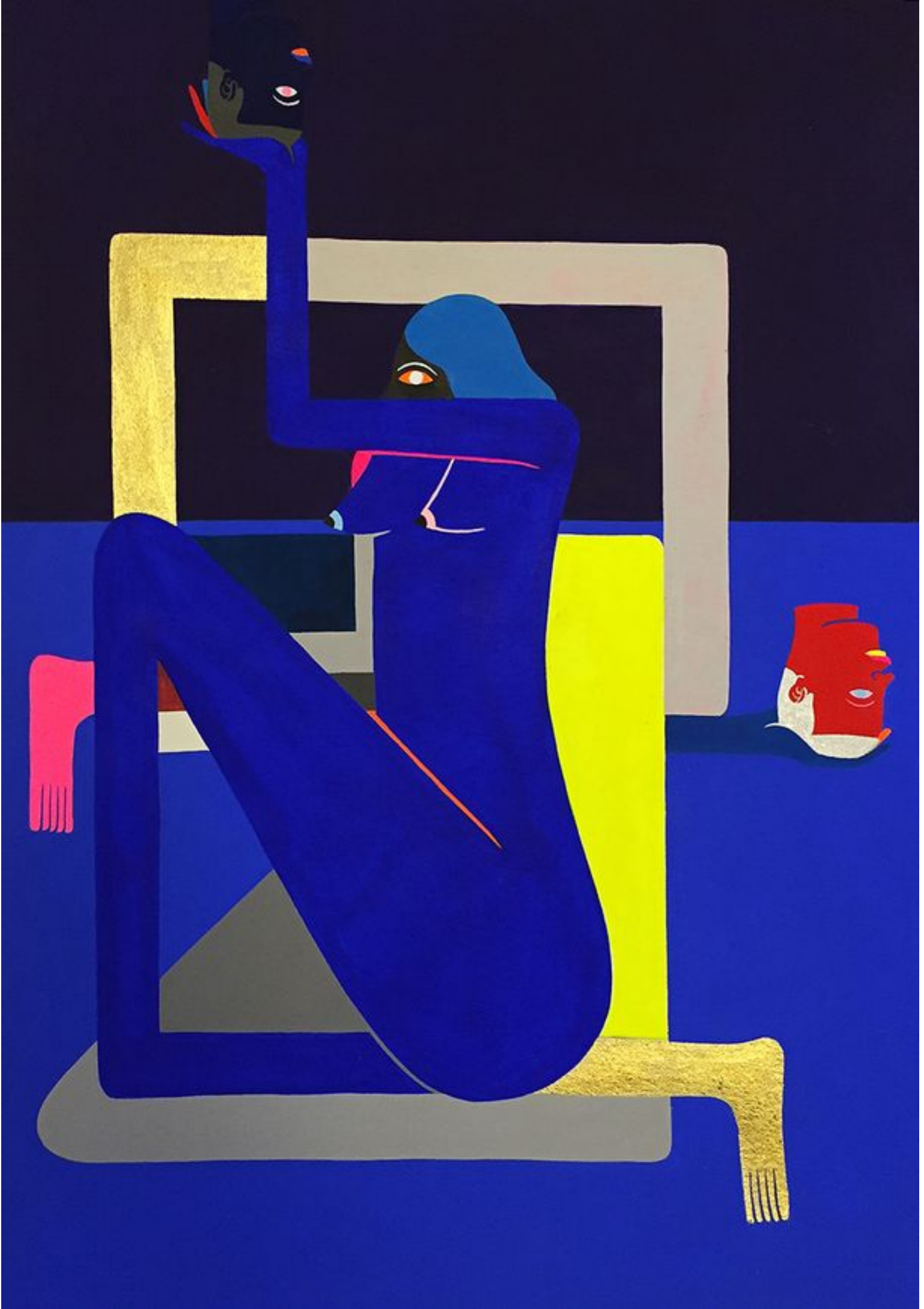
Richard Colman, Untitled (Blue woman), 2016, gouache and acrylic on paper, 28 x 38.5 cm