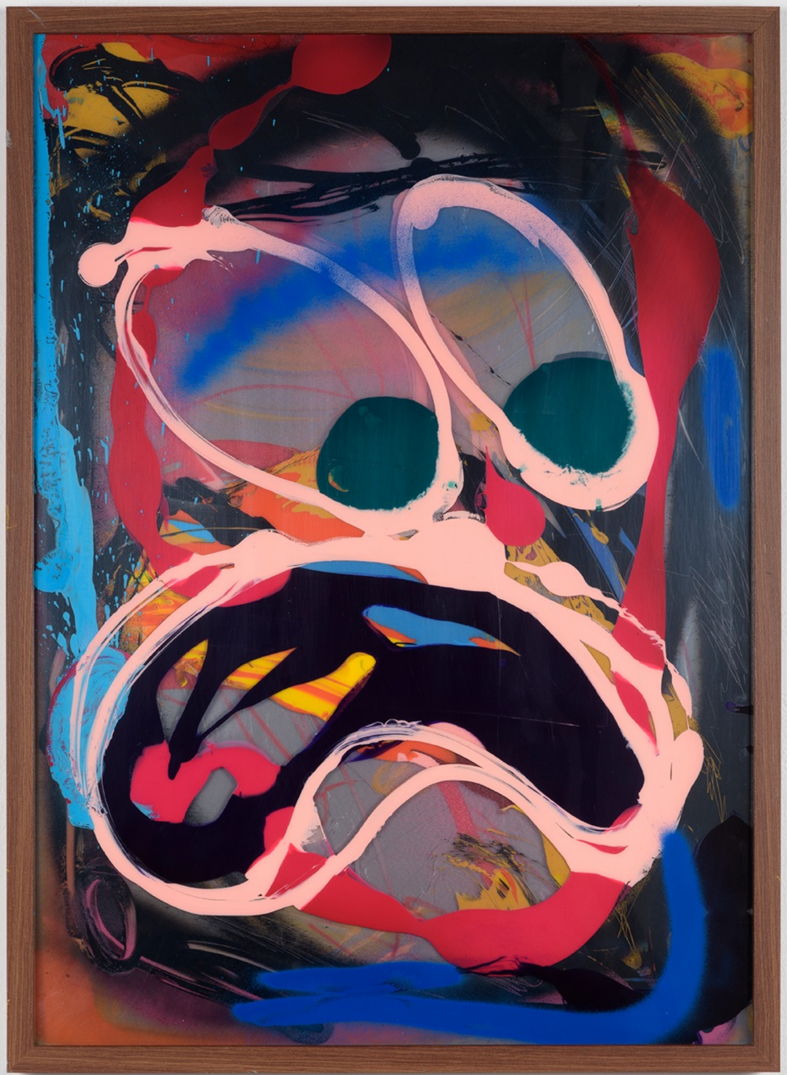
Devin Troy Strother No new n...s (Views from the 7) 2016 Mixed media and acrylic on plexiglass 28.5 x 20.5 inches