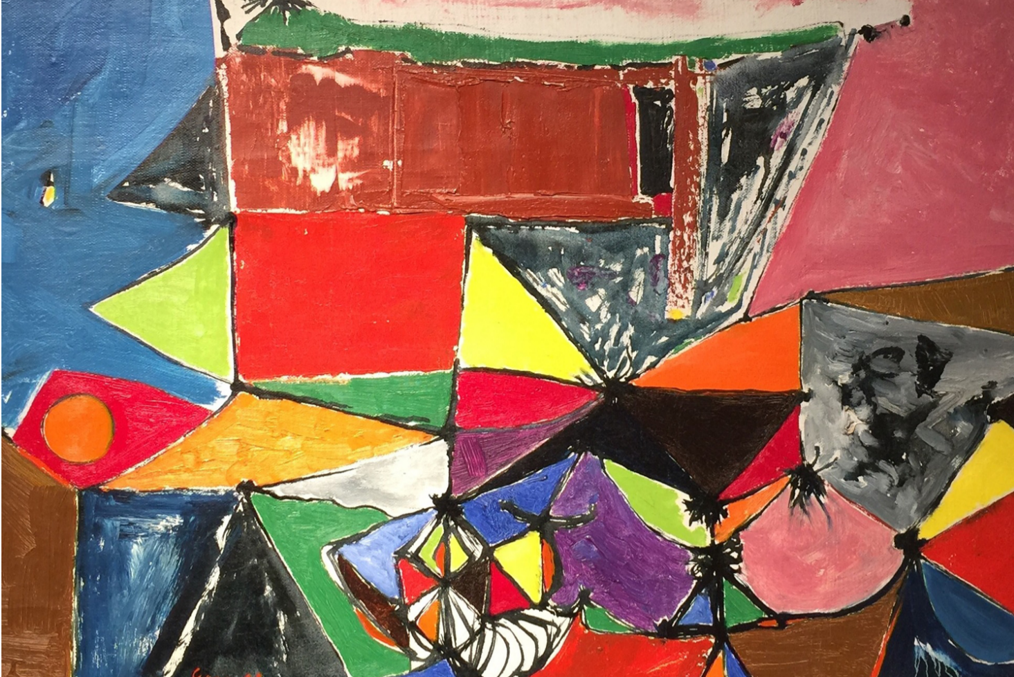
'Paysage' by William Gear, 1948.