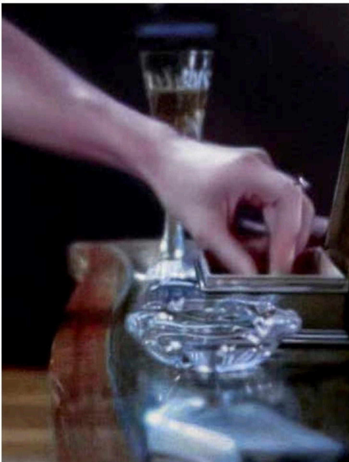
Betty's Case, New York, 1961 (detail) oil on linen 2013

Rendering still lifes from snapshots of period dramas played out on film, Leventis is concerned with the tension that is created between the painted and technological image. Looking through the filter of the digital screen he reflects how contemporary TV borrows configurations from painting, whilst himself borrowing back from the cinematic designs of the contemporary moving image. His work provides a familiarization and empathy with the cinematic subject, a feeling that he equates with the contemporary affinity to mass media images. This is further enhanced by the human touch, produced by the physical act of the painting process. In his new direction of work, Leventis focuses on interiors and characters that occupy suspense films, particularly cult films, that are noteworthy for their vivid Technicolor and stylistic flourishes.