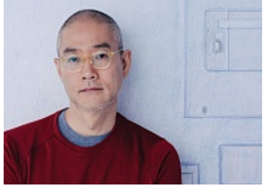
Globetrotting artist Do Ho Suh brings sights of London to Hong Kong