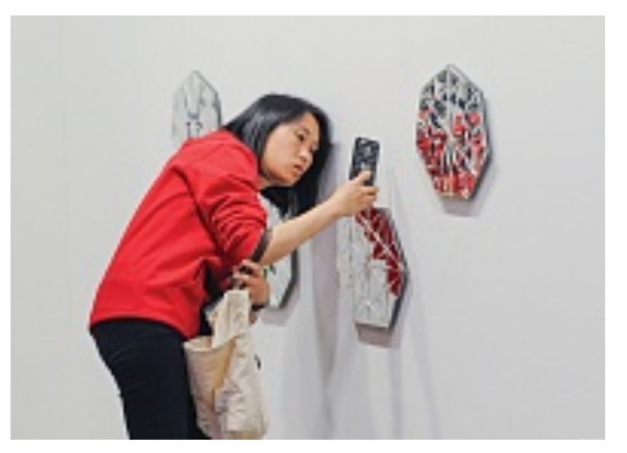
Interest in Middle Eastern art is on the rise in China