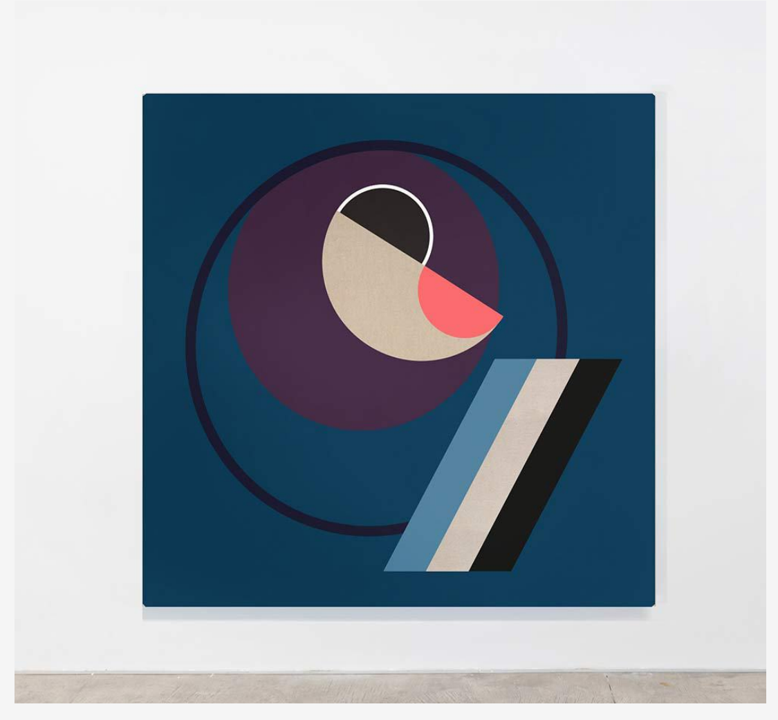
Sinta Tantra, Stranger in Town, 2016 150 x 150 cm Tempera on linen