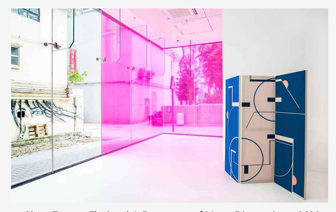
Sinta Tantra, Flatland A Romance of Many Dimensions, 2016 Pearl Lam Gallery, Hong Kong Solo show

It would be nice to see more female artists selected for things, especially female artists of colour. However, I do believe things are changing... slowly but surely.