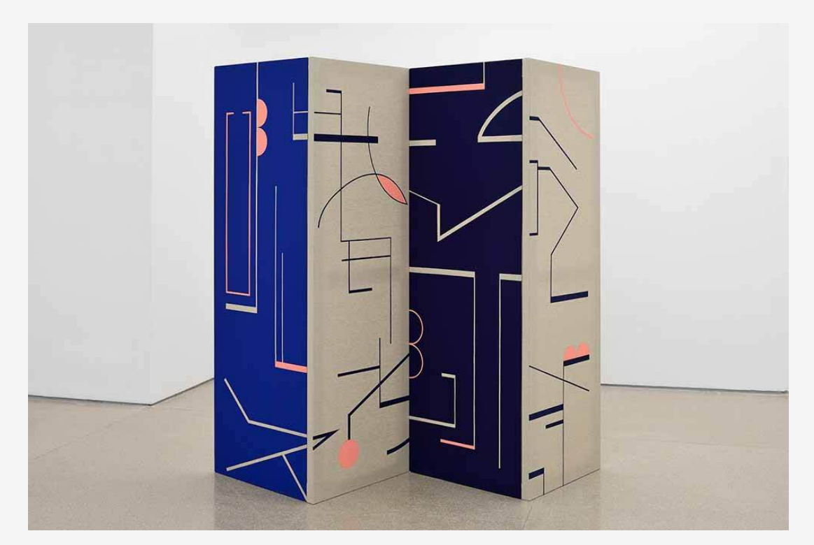
Sinta Tantra, The Piranesi Effect (Screen), 2017 4 panels of 180 x 60 cm Tempera on linen