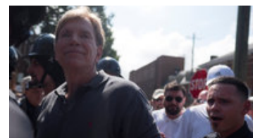
Ex-KKK Leader David Duke Has