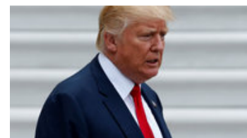
Trump Lets Loose On Twitter, But