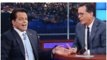
Stephen Colbert Asks The Mooch