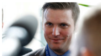
White Nationalist Calls Trump's