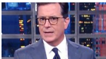
Stephen Colbert Attempts To List