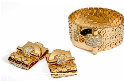
http://uk.blouinartinfo.com/news/story/2626304/jewellery-russian-works-of-art-gold-boxes-and-vertu-at-tefaf ( http://uk.blouinartinfo.com/node/2627003 )

FAIRS Jewellery, Russian Works of Art, Gold Boxes, and Vertu