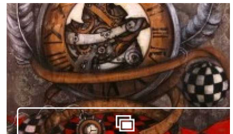
http://uk.blouinartinfo.com/news/story/2624918/tangibility-in-time-by-shazia-salman-at-artciti-karachi ( http://uk.blouinartinfo.com/node/2624879 )

( http://uk.blouinartinfo.com/news/story/2626228/books-maps-and-manuscripts-at-tefaf-new-york-fall-2017 )