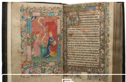
http://uk.blouinartinfo.com/news/story/2626228/books-maps-and-manuscripts-at-tefaf-new-york-fall-2017 ( http://uk.blouinartinfo.com/node/2627811 )

( http://uk.blouinartinfo.com/news/story/2626304/jewellery-russian-works-of-art-gold-boxes-and-vertu-at-tefaf )