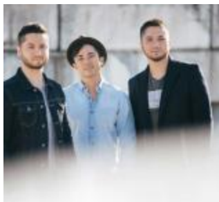
Boyce Avenue is