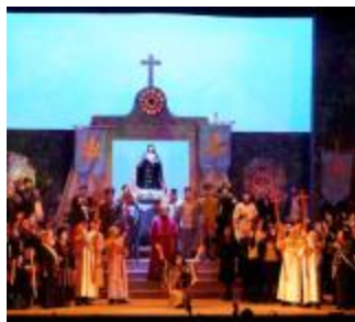
Forty years of