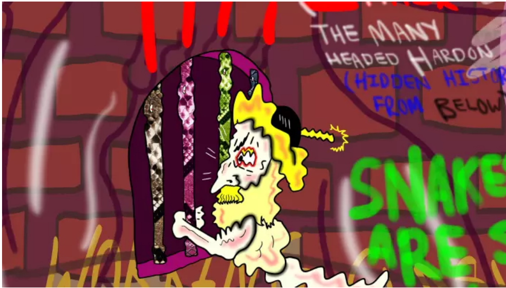
Hardeep Pandhal's 'Pool Party Pilot' is in the New Museum's triennial Ariella Budick YESTERDAY

The latest edition of the New York art event casts its net wide but captures a narrow set of political views