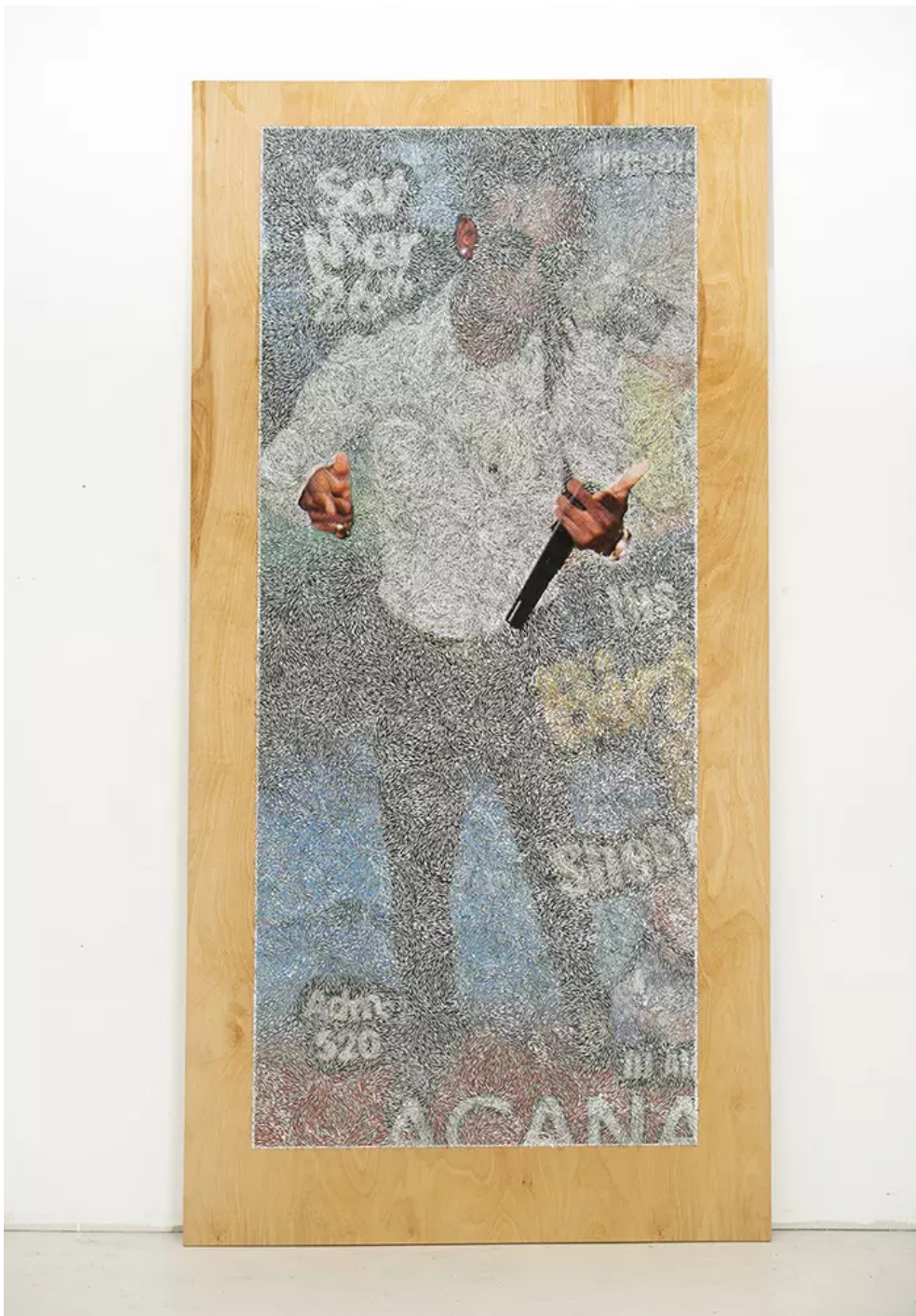
Wilmer Wilson's 'IVAfr' (2017). Courtesy the artist and Connersmith, Washington DC

Of all the possible ways to convey a political point of view, conceptual approaches come off as the least fruitful. The Greek collective Kernel has crafted an opaque sculptural mish-mash on the theme of global finance and urban infrastructure, made out of metal, piping and some bubbling, melty, copper-plated stuff. It's a visual nil, and the accompanying label does nothing to clarify its message.