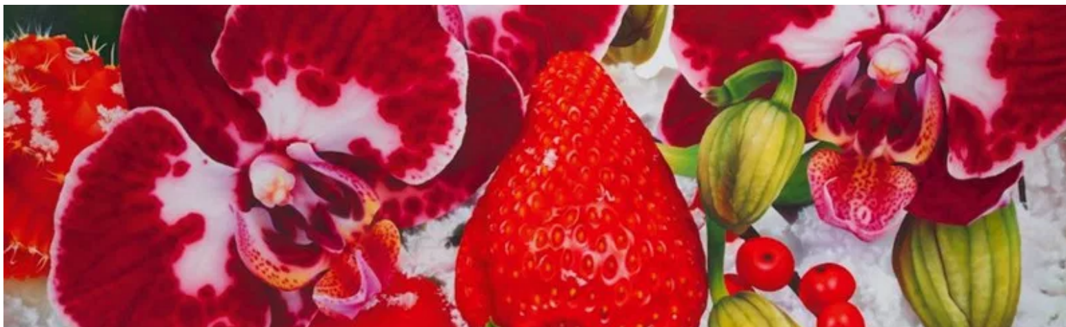
Marc Quinn, South China Sea.