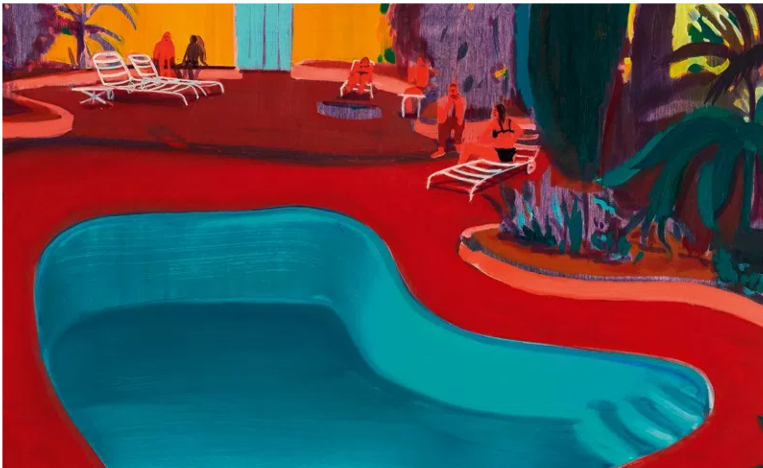
Jules de Balincourt, Valley Pool Party, 2016.

installation, Planet, exhibited in Singapore and in the gardens of Chatsworth House, UK, Quinn raises what it is to be human in the modern world of today and shows the vulnerability of nature and our needs to nurture it.