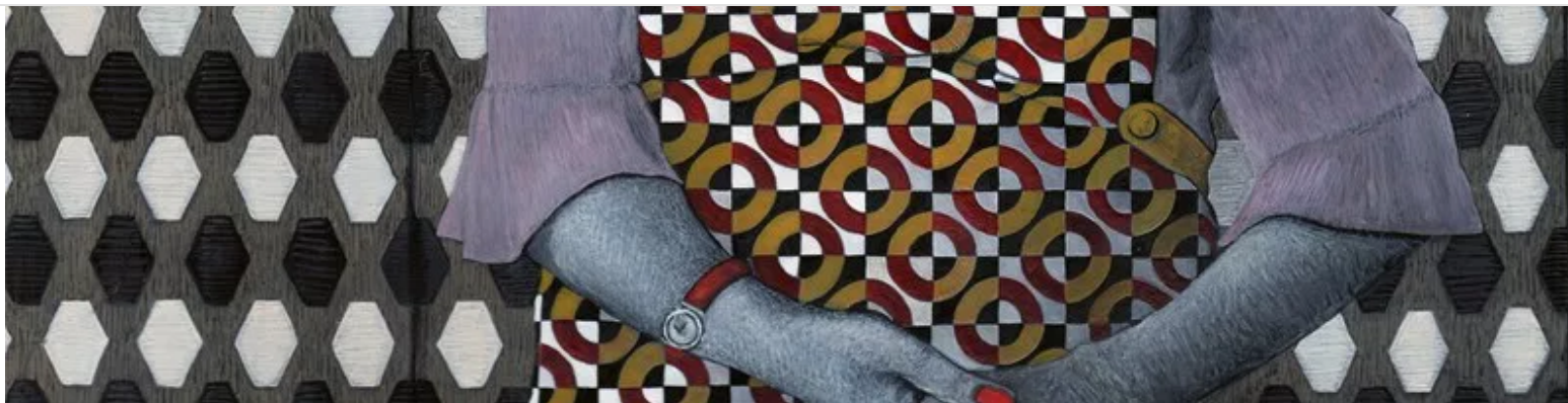
Soheila Sokhanvari, Dark Horse , 2017.

Soheila Sokhanvari is an Iranian-born artist who layers political history with enigmatic, mysterious stories. The artist's original and intriguing compositions of pattern, colour and portraiture invite the audience to question the artwork's message and encourages viewers to reach their own conclusion about its meaning. Her works collectively explore themes of trauma and hope. Sokhanvari uses family photographs and pre-revolutionary Iran as the inspiration behind her work.