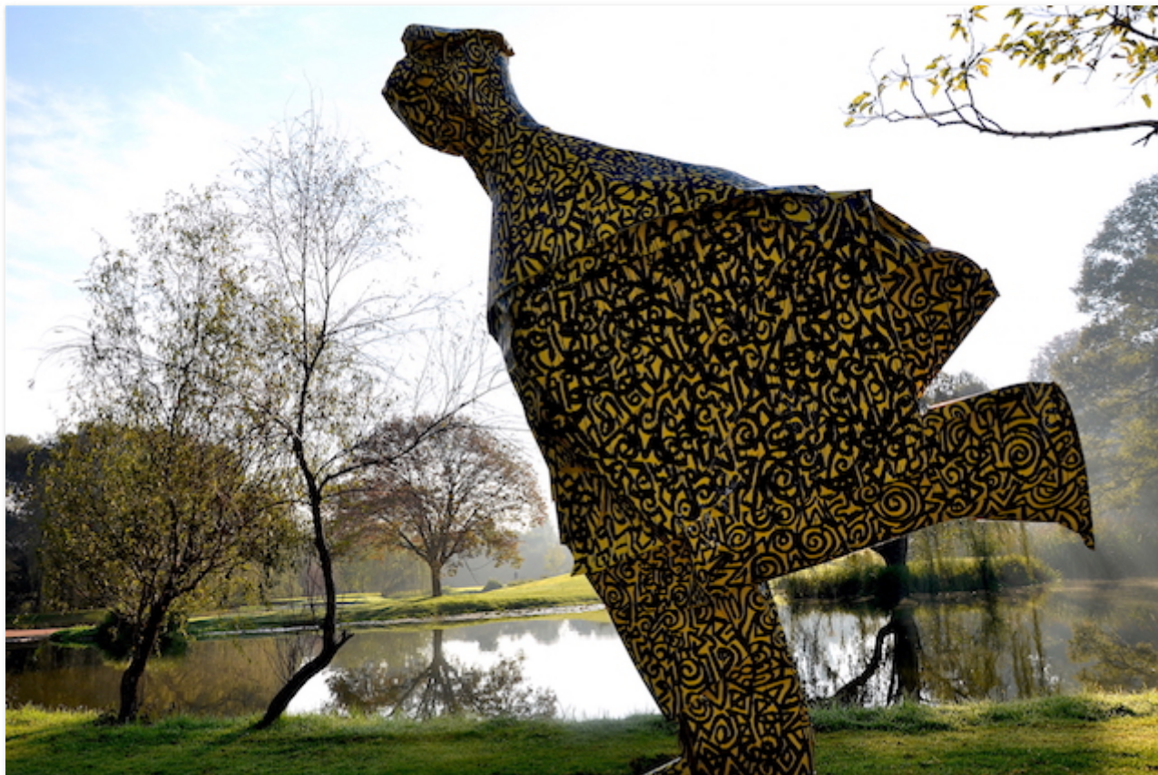
Victor Ehikhamenor, 'Isimagodo', 2017, sculpture, 457 cm (height).

For more than a decade, the annual Art Dubai fair has played a key role in the Emirate's journey towards becoming a leading global destination for arts and design. The collaborative venture showcases a broad programme of creative exhibitions and events, positioning Dubai as an international destination of culture, partnership and social engagement.