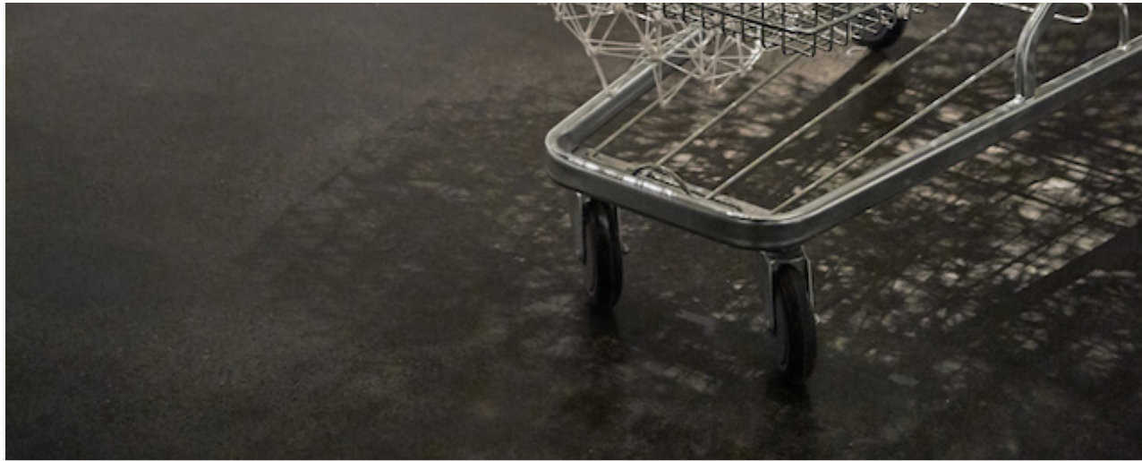
Poonam Jain, 'Shopping', 2016.