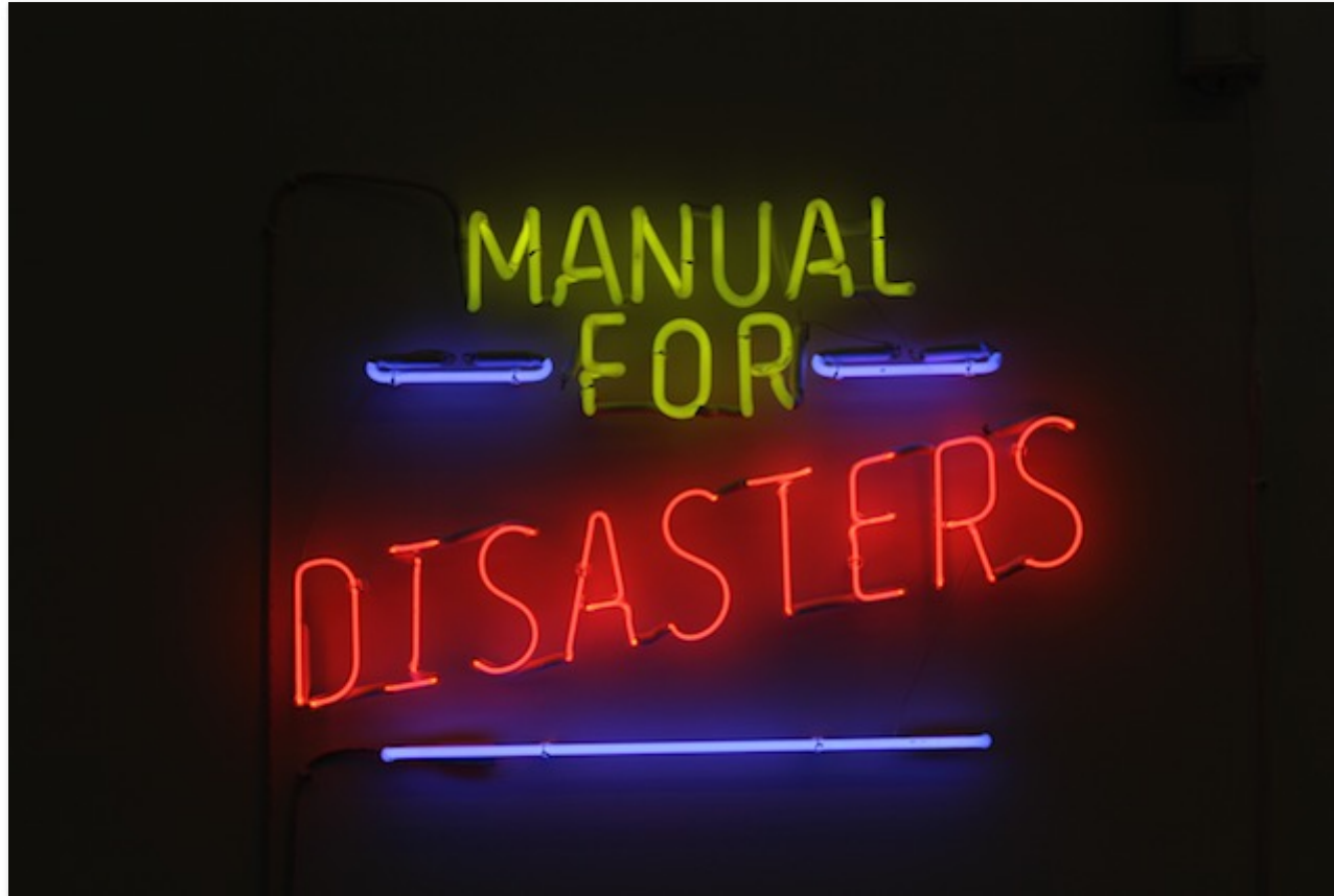
Raed Yassin, 'Manual for Disasters', 2017.