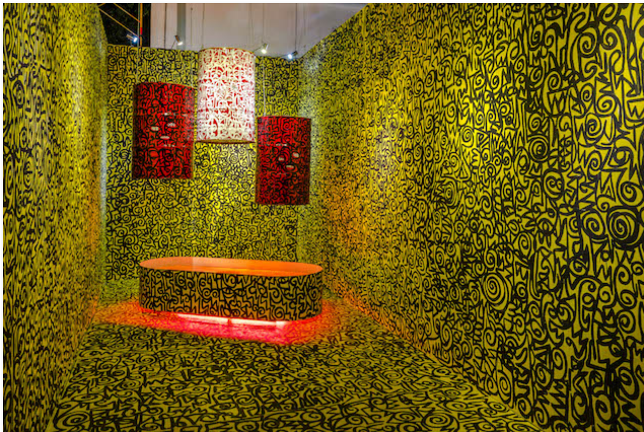
Victor Ehikhamenor, 'Wealth of Nations', 2015, installation, variable dimensions.

The preeminent platform to interact with art from the Middle East and North Africa, Art Dubai mirrors the cosmopolitanism and diversity of its locale and the wide variety of its international collaborators. While previous years have documented growth in sales and participation, the 2018 edition offers itself as a cultural think-tank where socially-committed expansion, diversity, education and communal support are not only present, but in abundance.