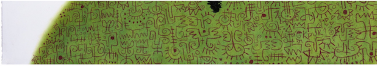
Viktor Ekpuk, 'Composition #14 (Santa Fe Suite)', 2013.

Alongside the fair's bustling modern art section and lecture series, the curatorial team has made great strides in expanding the 2018 Contemporary segment. This year, 11 African art-specialised galleries from Africa, Europe and the Americas will represent multidisciplinary artists from Cameroon, Nigeria, Ethiopia and the like.