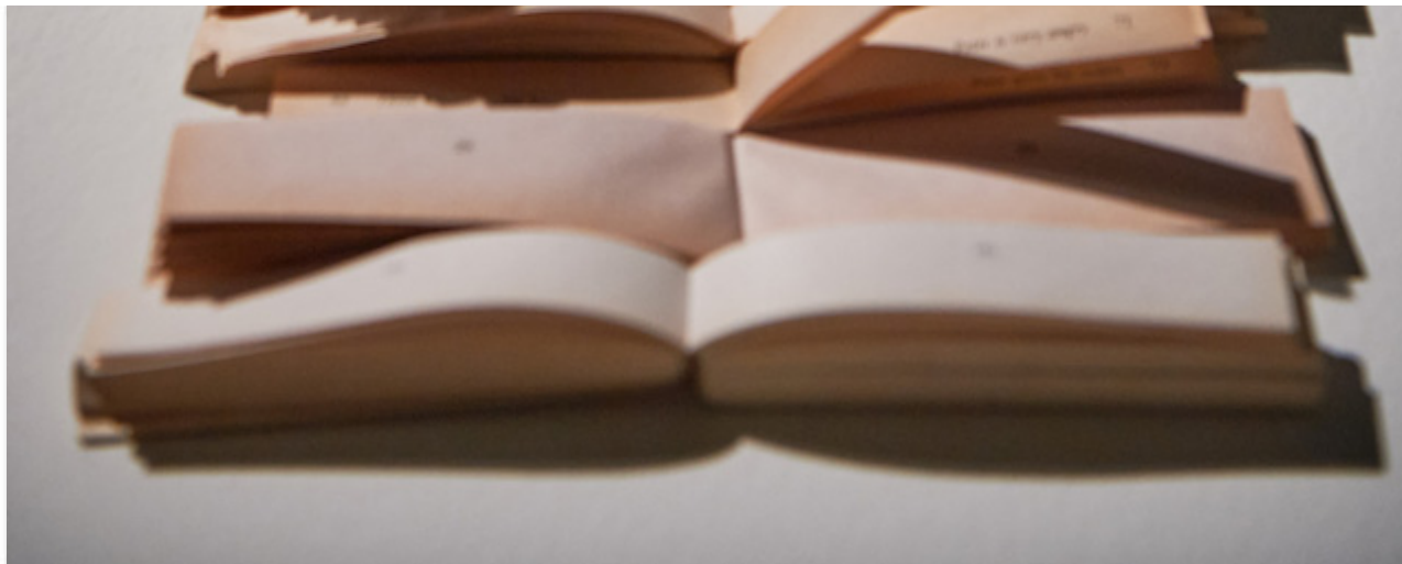
Poonam Jain, 'Chanting', 2016. Image courtesy 1×1 Art Gallery.