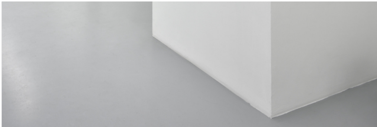
Sara Ouhammadou, 'Wassalnailou #2', 2016.