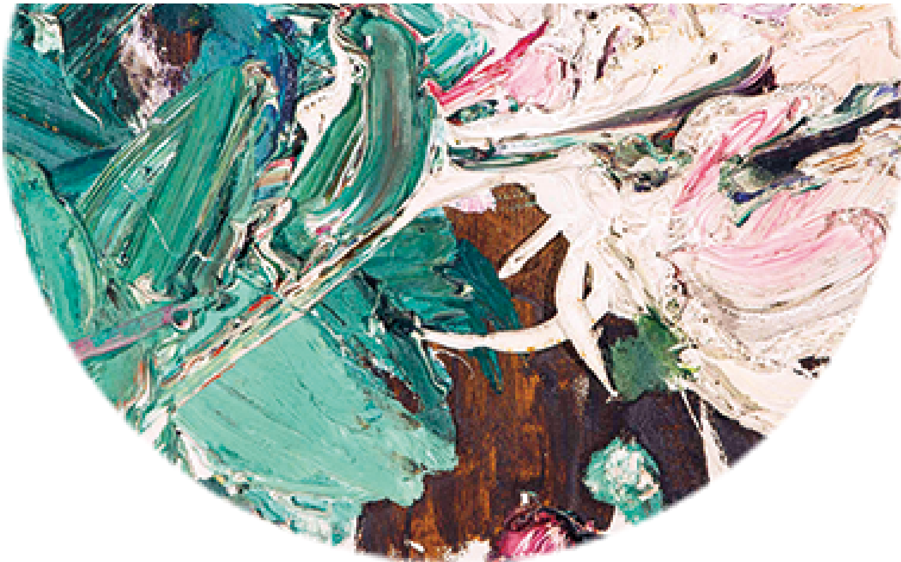
Manoucher Yektaei's 1959, still life with flowers.