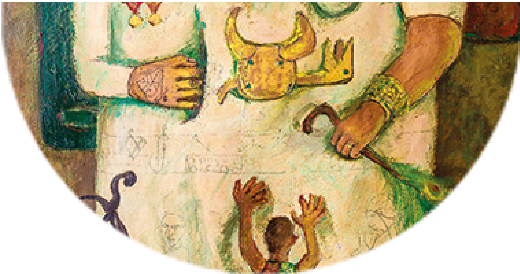
The Family by Abdelhadi Al Gazzar as part of 'That Feverish Leap into the Fierceness of Life'.