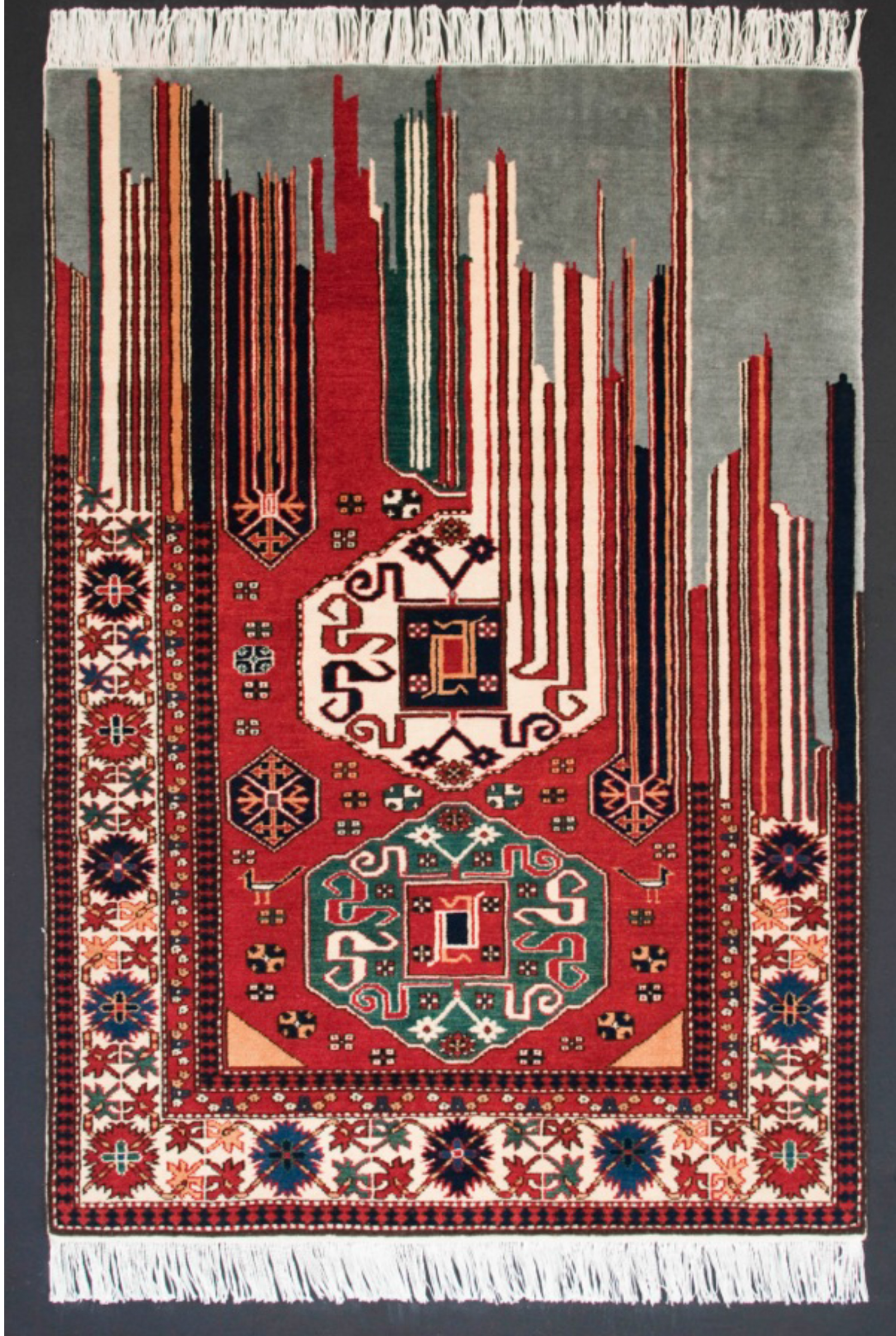
Faig Ahmed "Restraint"