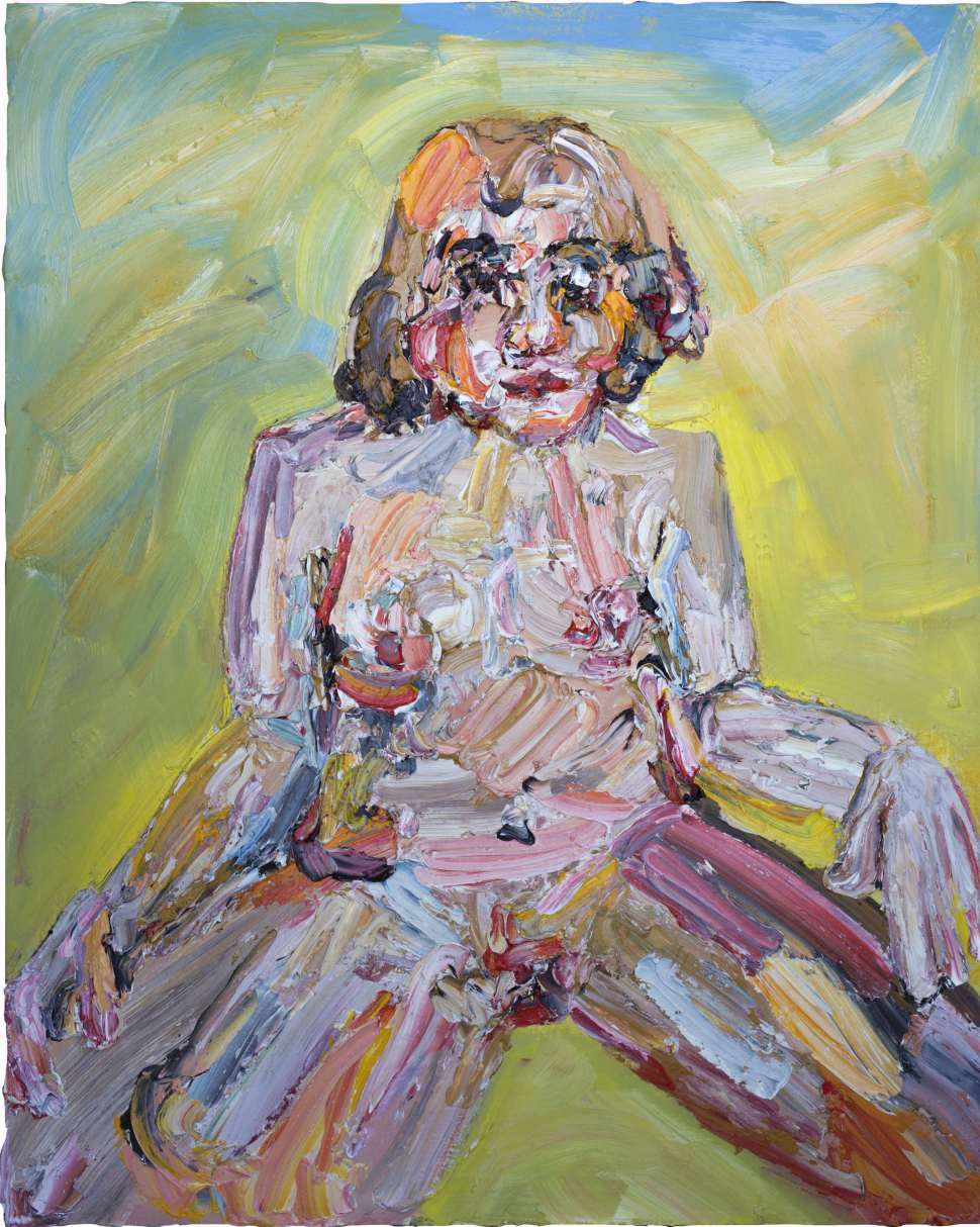
The Dream (2018).