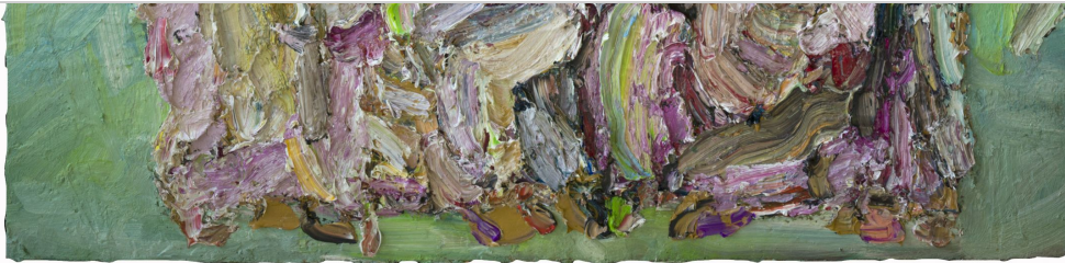
Modern Times (2018).