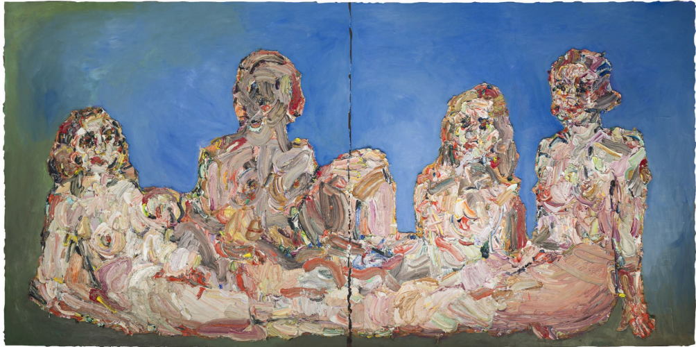
Luncheon on the Grass (2018).