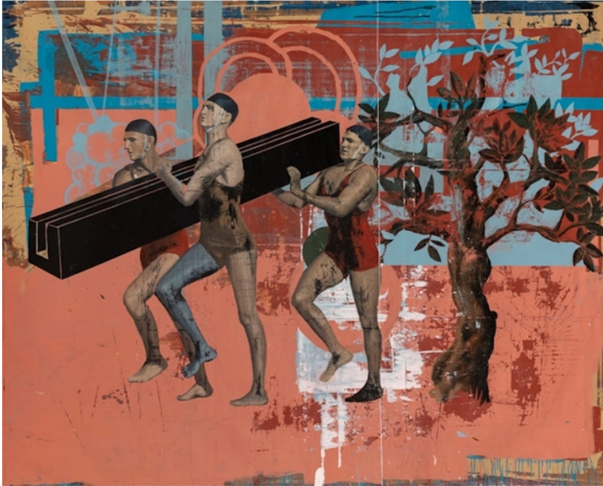
Juan Miguel Pozo „After The Storm“, acrylic on canvas, 2017/18, courtesy of Janine Bean Gallery

26.04.2019 @ René Talmon L'Armée: Linienstr. 109, 10115 Berlin | renetalmonlarmee.com