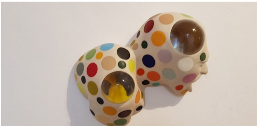
Lido Rico „Psigé“, Polyester resin, glass and collage, 2016, courtesy of Luisa Catucci Gallery

26.-28.04.2019 @ 5space.berlin : Paul-Lincke-Ufer 42, 10999, Berlin | Space.berlin