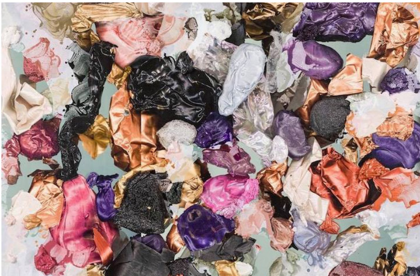
André Hemer „Illuminations 7*“ (Vienna 2019, 03-04.13:37 CET) (Acrylic and pigment on canvas 61 1/8 x 88 1/4in)

Finally Spring! That time of the year when everyone in Berlin is out in the fresh air, every one with new stories to tell. The Gallery Weekend end of April makes a perfect backdrop for grooving through the city on bike. So check your tires, breaks, lights and bells and enjoy a tour from Mitte to Neukölln, visiting some art galleries on the way – it is what I call a perfect combo: a lot of art input and environmental consciousness aligned. Following here you will find an easy tour with some interesting pit stops. Saddle up!