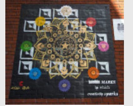
New Artworks Explore The Stories Your Sneakers Tell