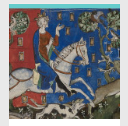
Top 10 London Art Exhibitions To See In March