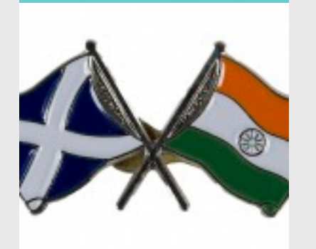
Share Your Journey And Be Part Of Jewish Museum's Exhibition