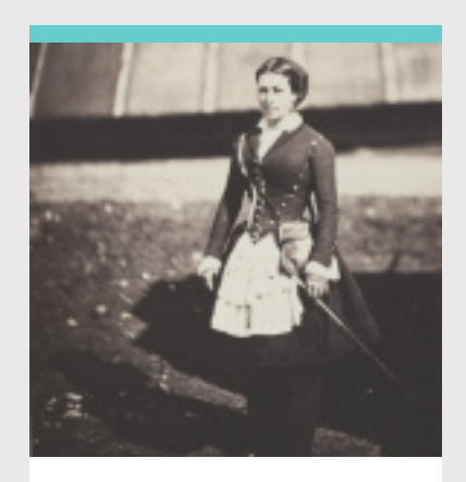
Salt And Silver: Early Photography At Tate Britain