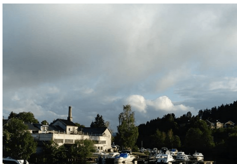
Vestfossen - @godteglasset

The city is about 45 minutes by train from Oslo and has a little less than 3000 inhabitants. By going there, it is not possible to remain indifferent to the natural beauty of the landscape and the feeling of peace that accompanies it. It is an ideal destination for adventurers, the curious, the travelers, the nature lovers, the people in search ... the lovers of arts.