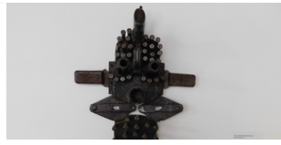
Gonçalo Mabunda