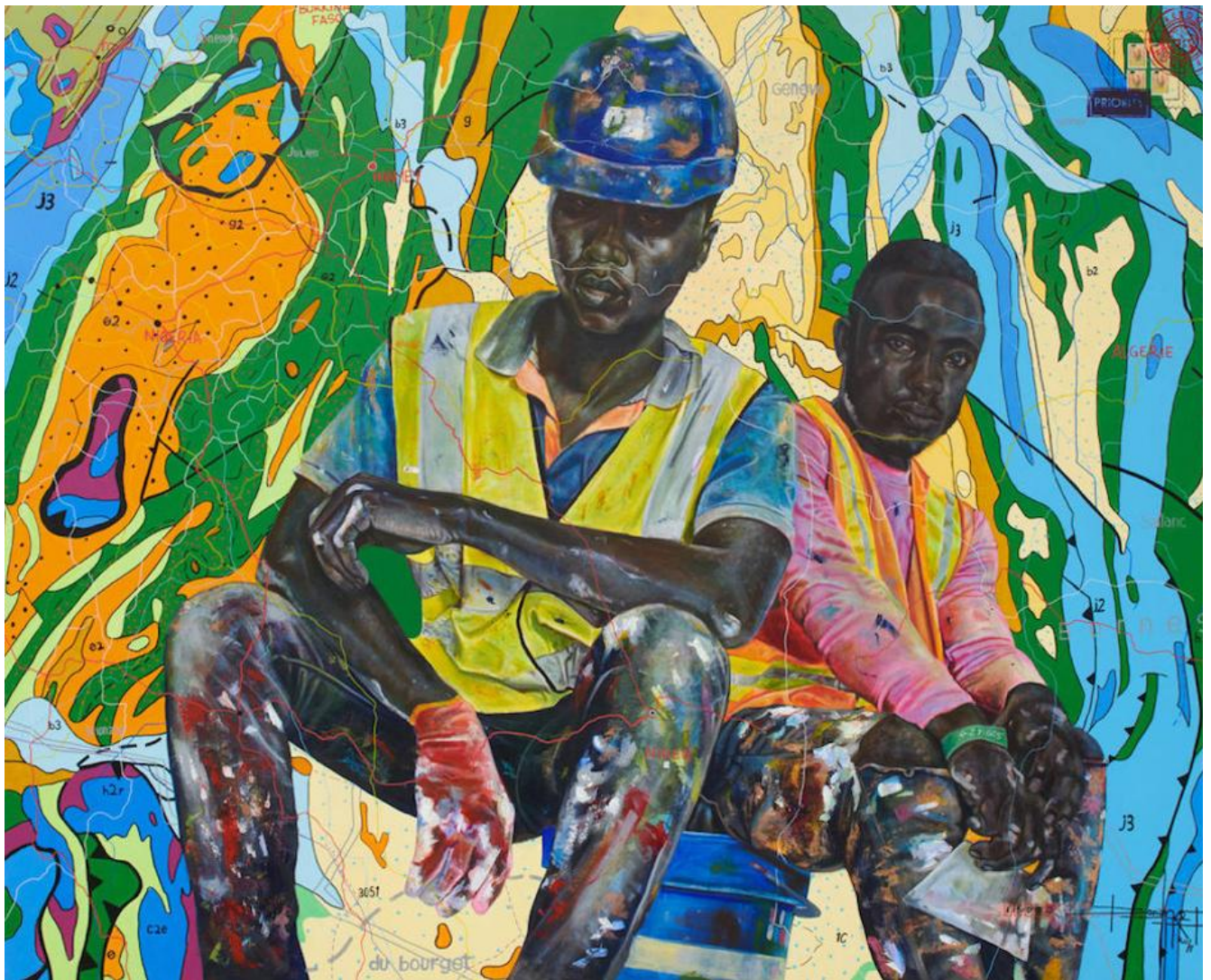
WWW.HEMLE.COM, 2018 Acrylic & Posca on canvas by Jean-David Nkot, courtesy Jack Bell Gallery JACK BELL GALLERY

Two Cameroon artists are on show at Jack Bell. Jean-David Nkot's heavily layered paintings show young migrant workers with maps in the background. Ajarb Bernard Ategua's vibrant paintings of city scenes show the foreign influence on Cameroon's largest city, Douala.