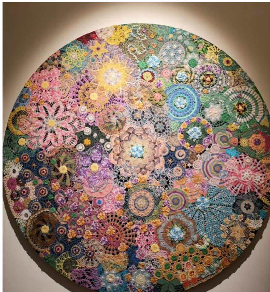
Zak Ové, Heaven, 2017 at 1-54 Art Fair, October 2019.

Zak Ové's recent curation of the exhibition, Get Up, Stand Up Now , about British black artists, was universally acclaimed. Here's another chance to see Zak Ové's own works, including "Heaven," a beautiful, large circular piece made of colorful crocheted doilies.