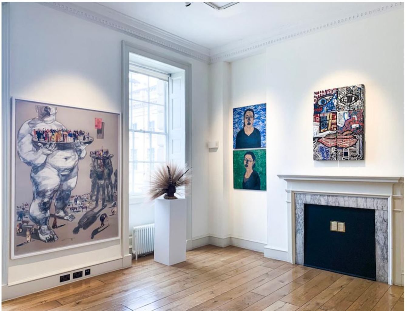
Kristin Hjellegjerde Gallery at 1-54 Art Fair, Somerset House, London, October 2019

I write about travel, food, culture and fashion.