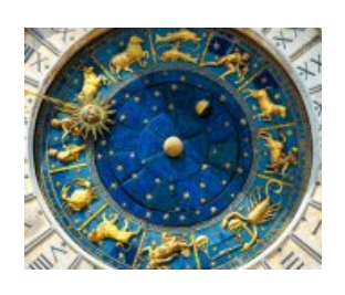
Inspire Me Where To Stay Based On Your Star Sign