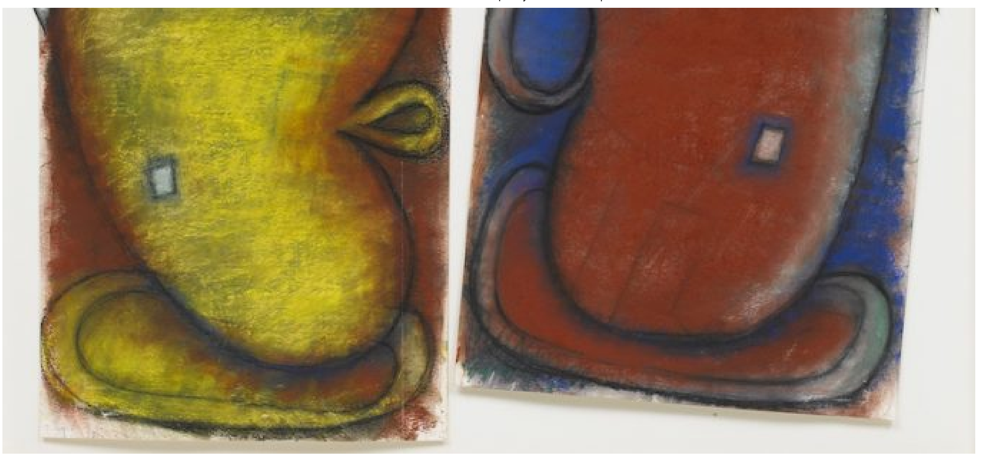
Elizabeth Murray Double, 1995