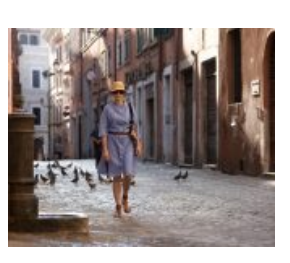
Uncategorized 10 Different Trips To Take Inspired By Our Favourite Films