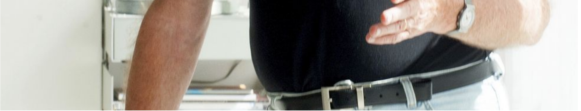
Dieter Rams