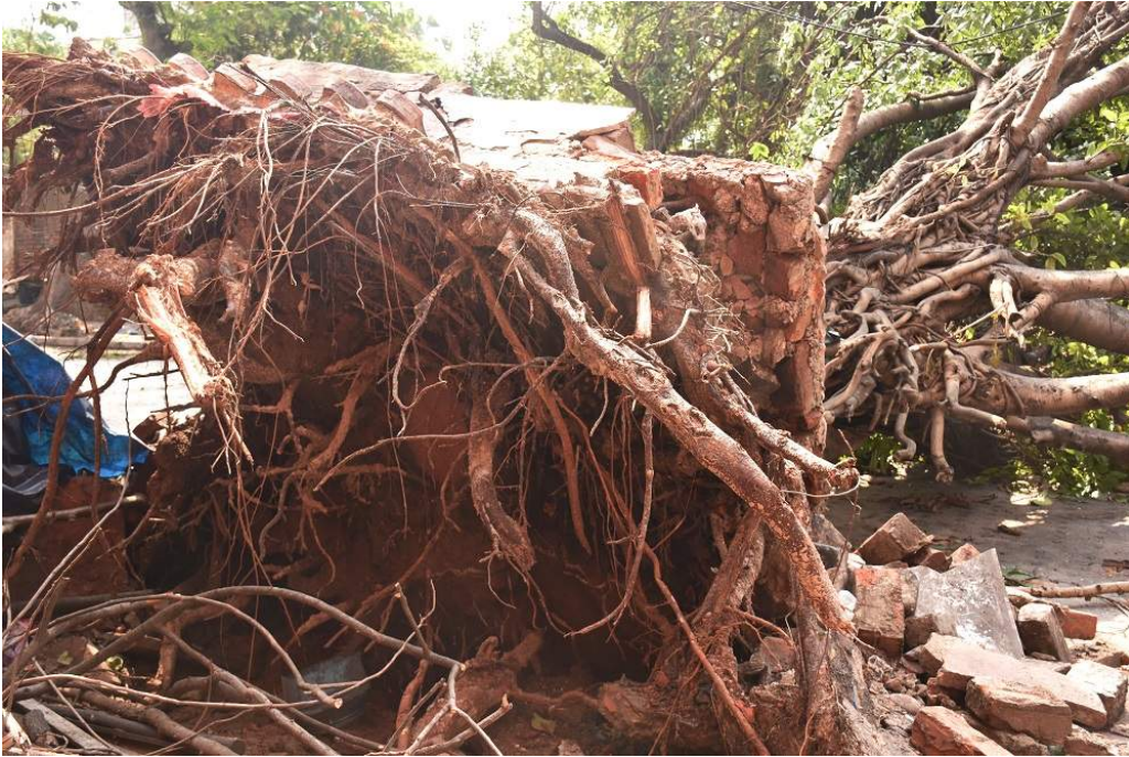
The devastations of Amphan captured by Agarwala

The artist also reveals that people from the city have been terribly forthcoming with their donations and participation, and she believes it's a sign of change. "The response has been overwhelming, people from all over want to donate to the cause. The project is to restore and rebuild our city Kolkata's green glory back that has been battered by Cyclone Amphan. I would like to turn abandoned and devastated areas , sidelanes into green spaces that will ultimately transform lives and lands, reduce carbon and protect species. The New Normal involves people to come together and plant trees, start a dialogue about ecology and preservation of nature , and engage urban residents to take responsibility for their surroundings," says Agarwala.