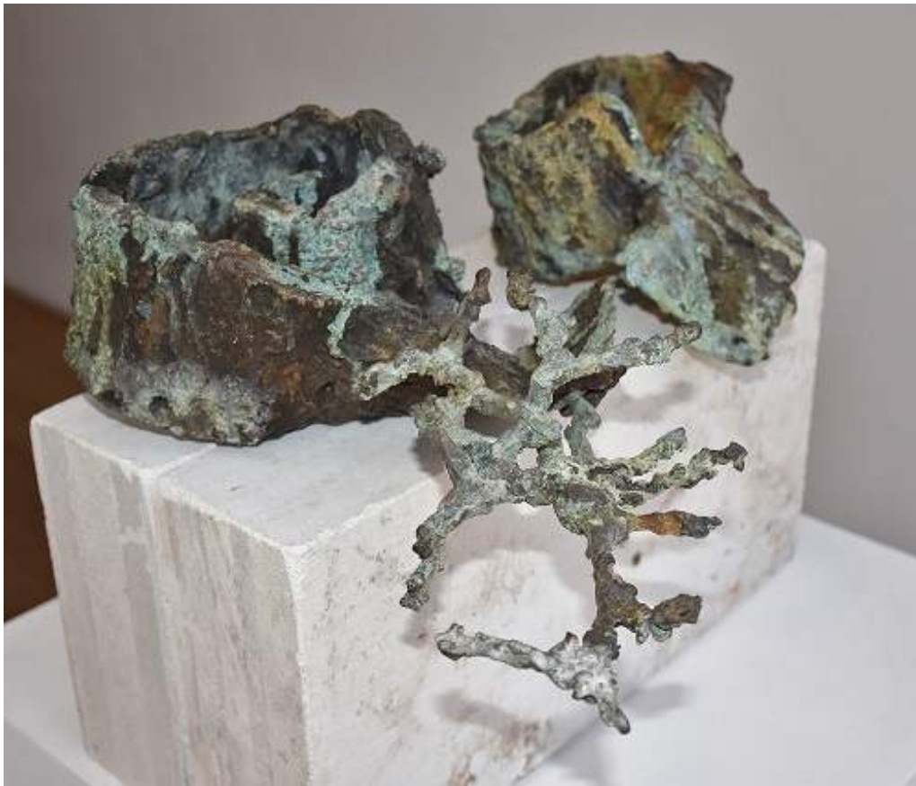
Sculpture by Radhika Agarwala; 'We Diverged InThe Wood III',bronze cast and concrete

“As much as we’d love for everyone to show up, that’s not entirely possible. So, we have allotted several time slots where 8-10 people would be planting trees at the same time to avoid too much contact. We will be taking care of these trees for the next 1.5 years and we plan to plant at least a 1000 saplings. We have opted for leafier species, since they provide the maximum oxygen. Deciding upon the venues was also a really crucial aspect since we couldn't just randomly plant a tree somewhere, a tree plantation drive needs a minimal amount of infrastructure in place so the plants can be nurtured,” Agarwala tells us.