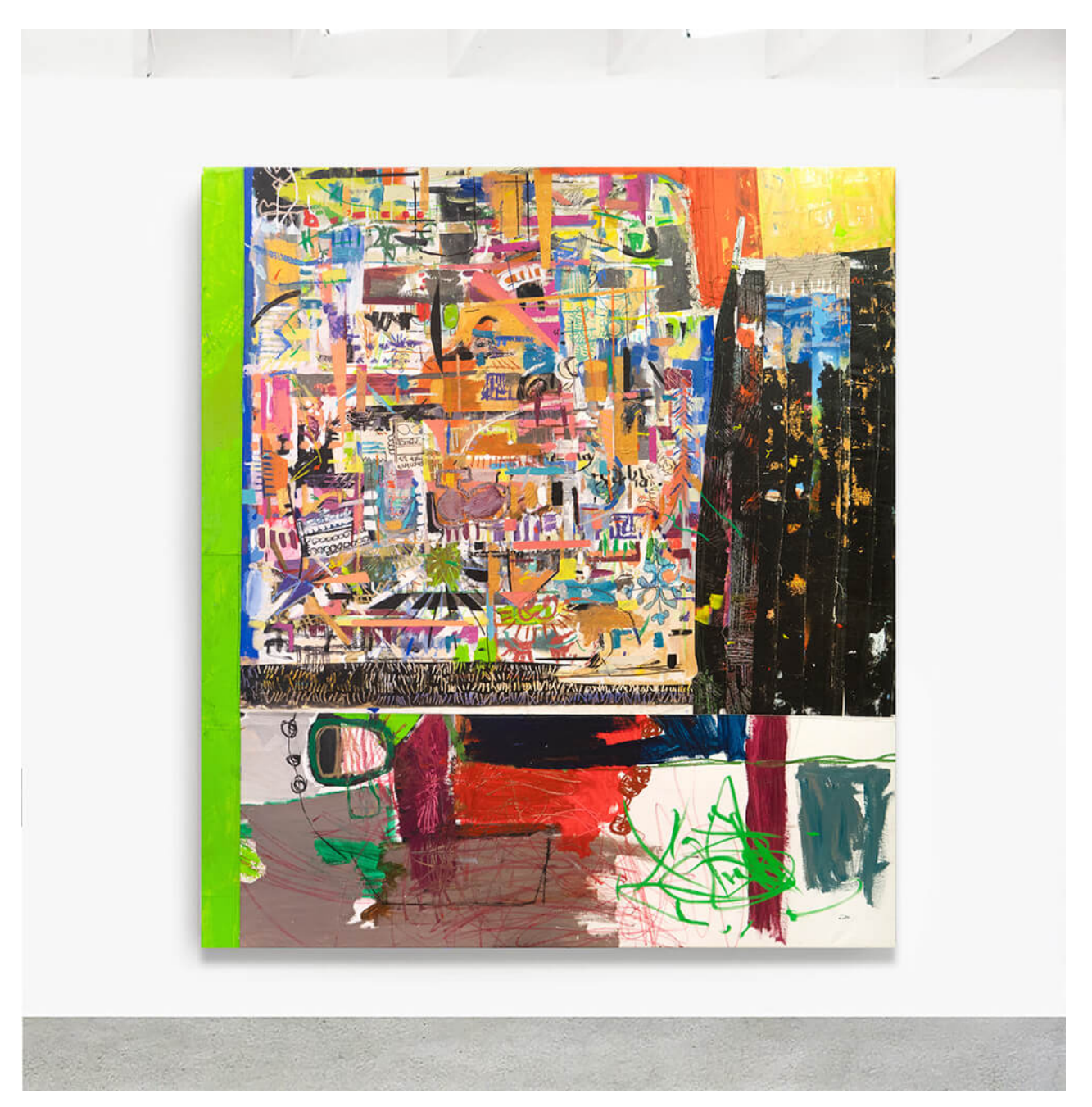
Wendimagegn Belete, Moment (22) , 2020. Mixed media, 180 x 160cm.

Kristin Hjellegjerde Gallery is opening their fourth gallery space at The Shrimp Factory in Nevlunghavn, Norway, with a solo exhibition by Ethiopian artist Wendimagegn Belete. Entitled 'Moment 2.0', the show is a continuation of Belete's recent London exhibition and presents a new collection of textural collage paintings that weave together archival materials and memories to create rich and complex visual landscapes, illustrating the continued murmurations of the past within the present.