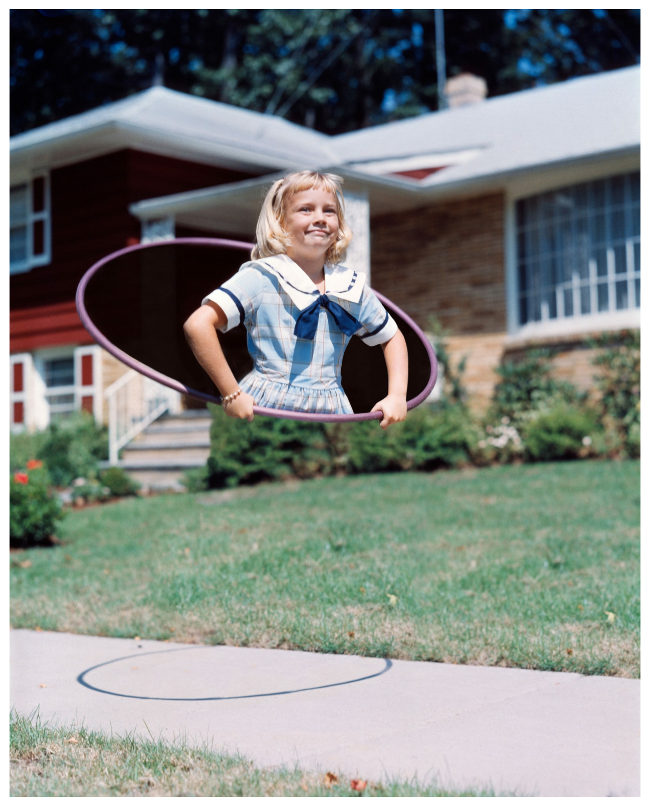
Weronika Gęsicka, Untitled 56