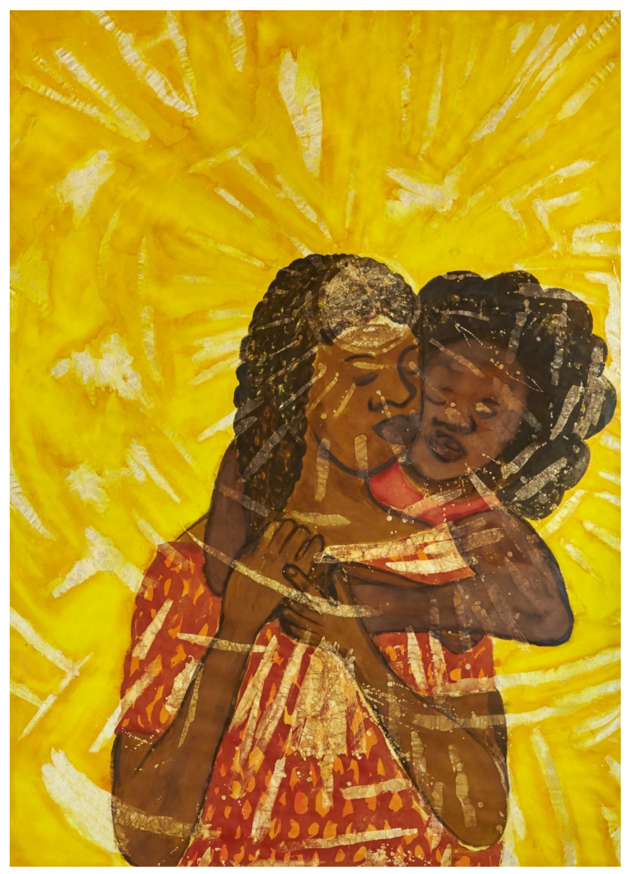
Sola Olulode, Eternal Light, 2020. V.O. Curations