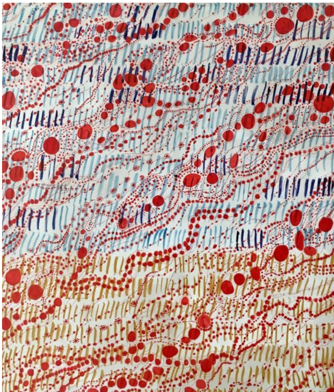
One Year In The Bush, 2016

Other solo shows include Not for The Kid's Room (2018), I Think Therefore I # (2015) and In Search of Lost Space (2013) - all at Kristin Hjellegjerde Gallery in London - Brave New World Hits a Glitch at Rook and Raven Gallery, London (2013), and My Bunny is Full of Teeth and Other Stories at London's Roa Gallery (2011).