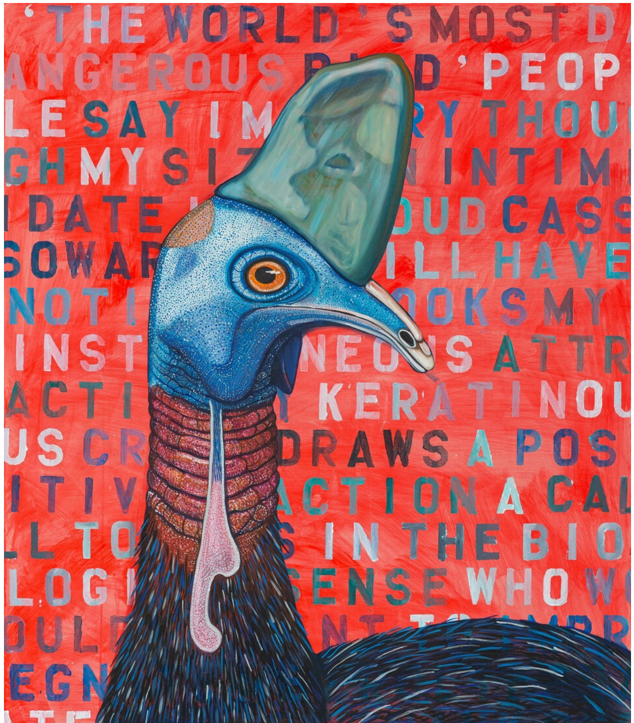
The Cassowary, 2020