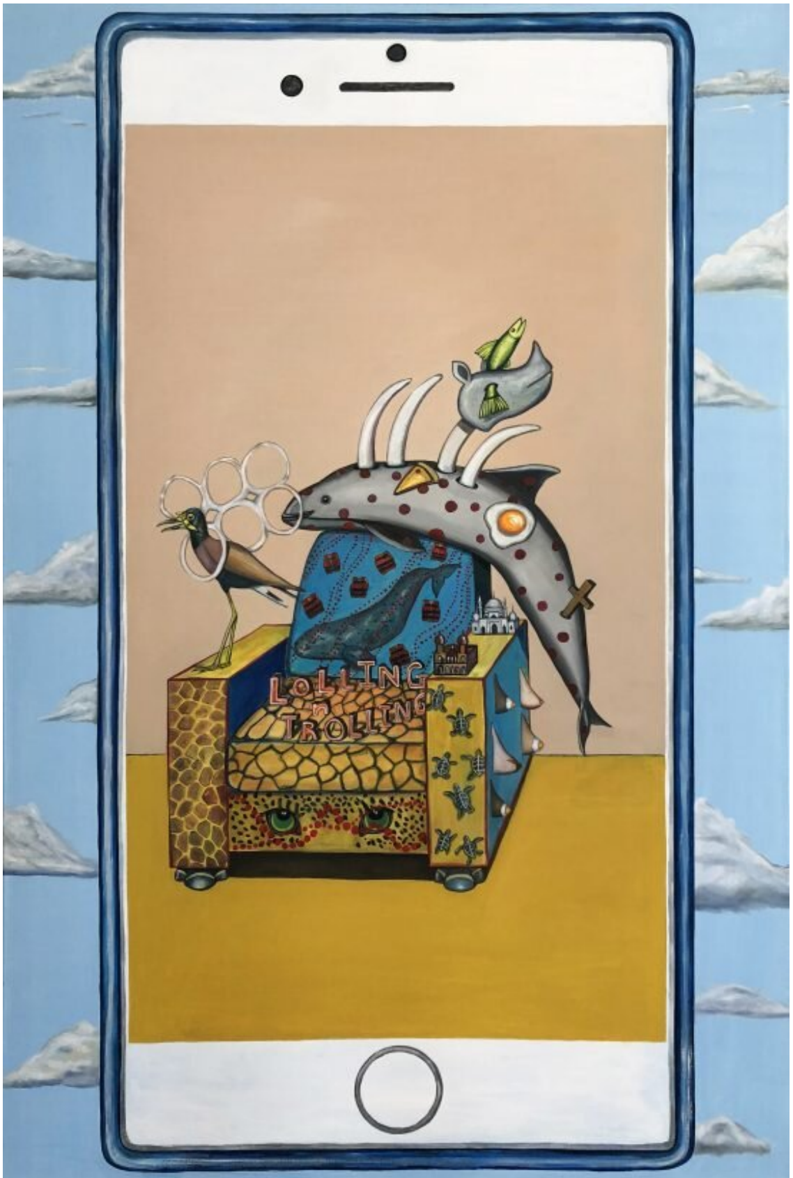
Comfort of Your Living-Room, 2018