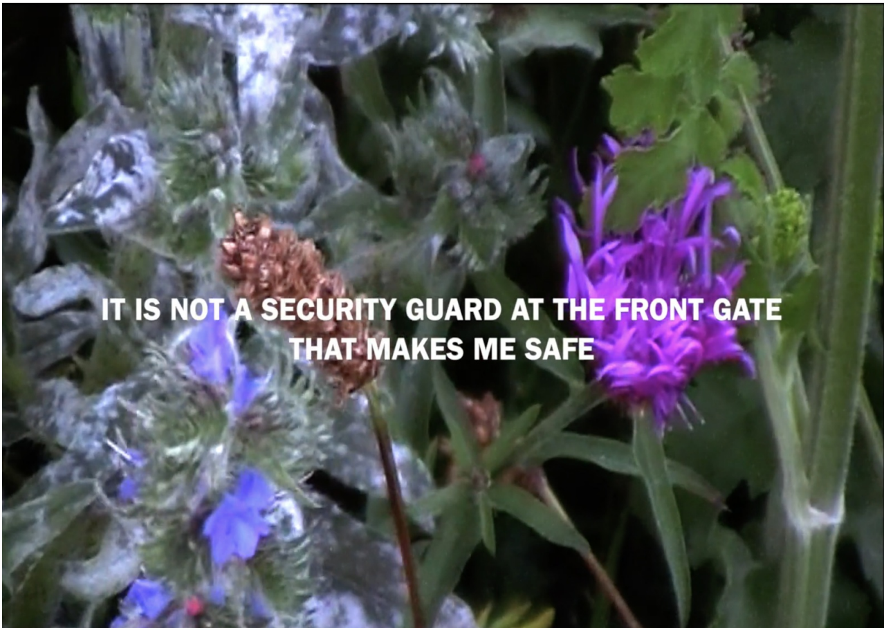
Peter Spanjer, still from Make Me Safe , 2020.

His practice is like a collage, gradually layering sound, image and text to build a rich sense of depth. Sometimes the shots are an assemblage of different moving fragments at the same time. He typically begins with the sounds, either creating them himself or weaving together fragments from other sources.