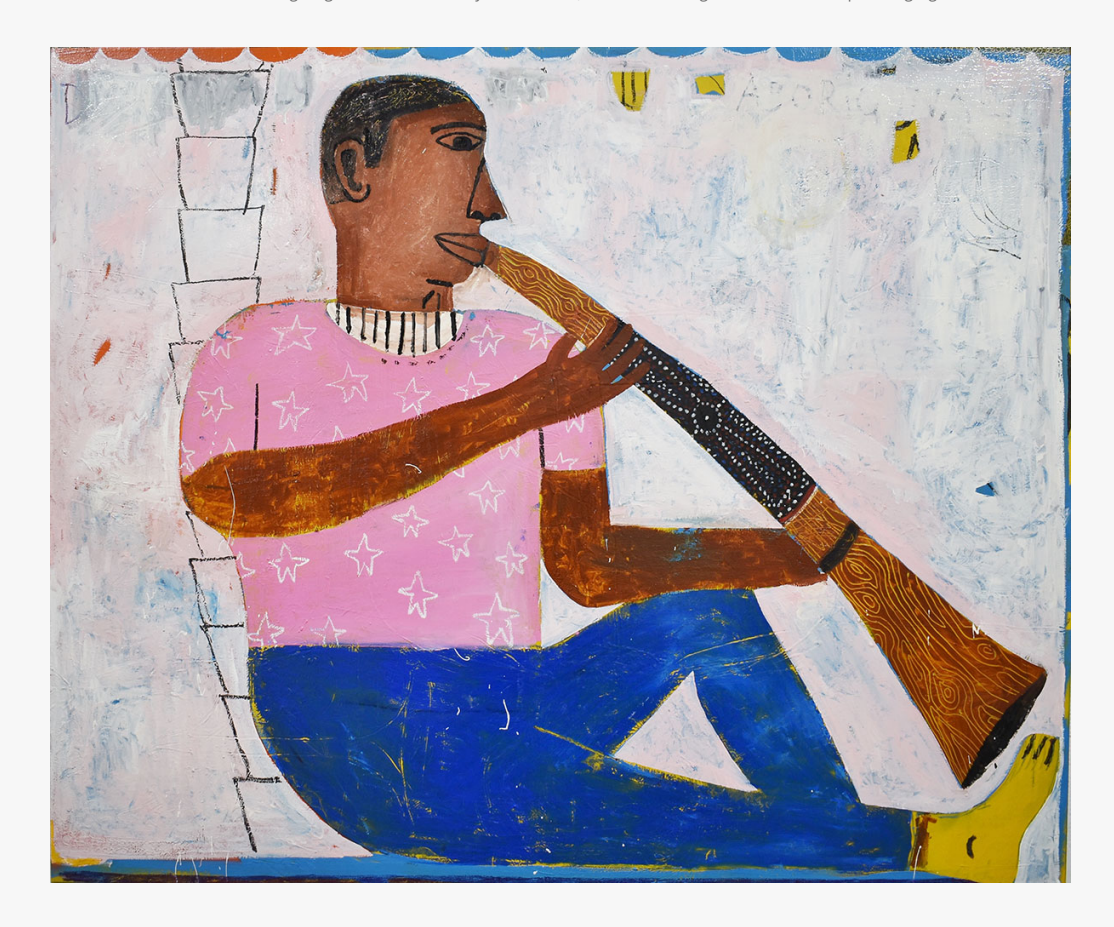
Tell us about your style and technique. Any secret that can be told? My style can best be described as naive and childlike. That's the atmosphere in which I try to work. I always try to paint a recognizable image that gives the impression that it hasn't been thought about for too long. It has to come about very spontaneously. Almost like a child would make

So it's difficult to answer this question. What I can say is that my latest series is all about music. 'Allegro', the name of the exhibition comes from the Italian music term 'Allegro' and means a 'fast,' cheerful 'or' lively 'piece of music. The tittle not only describes my creative process but also provides a lens through which to interpret these works. They are all paintings that in one way or another have to do with music and portray individuality, laughter, storytelling, creativity and wonder. I have no idea what theme I'm going to work on for my next series, but I'm looking forward to start painting again!