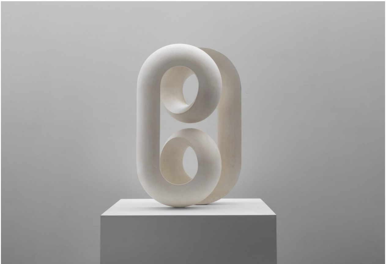
Paul de Monchaux, Return , 2020, plaster, to be cast in bronze, 71 x 46 x 27cm