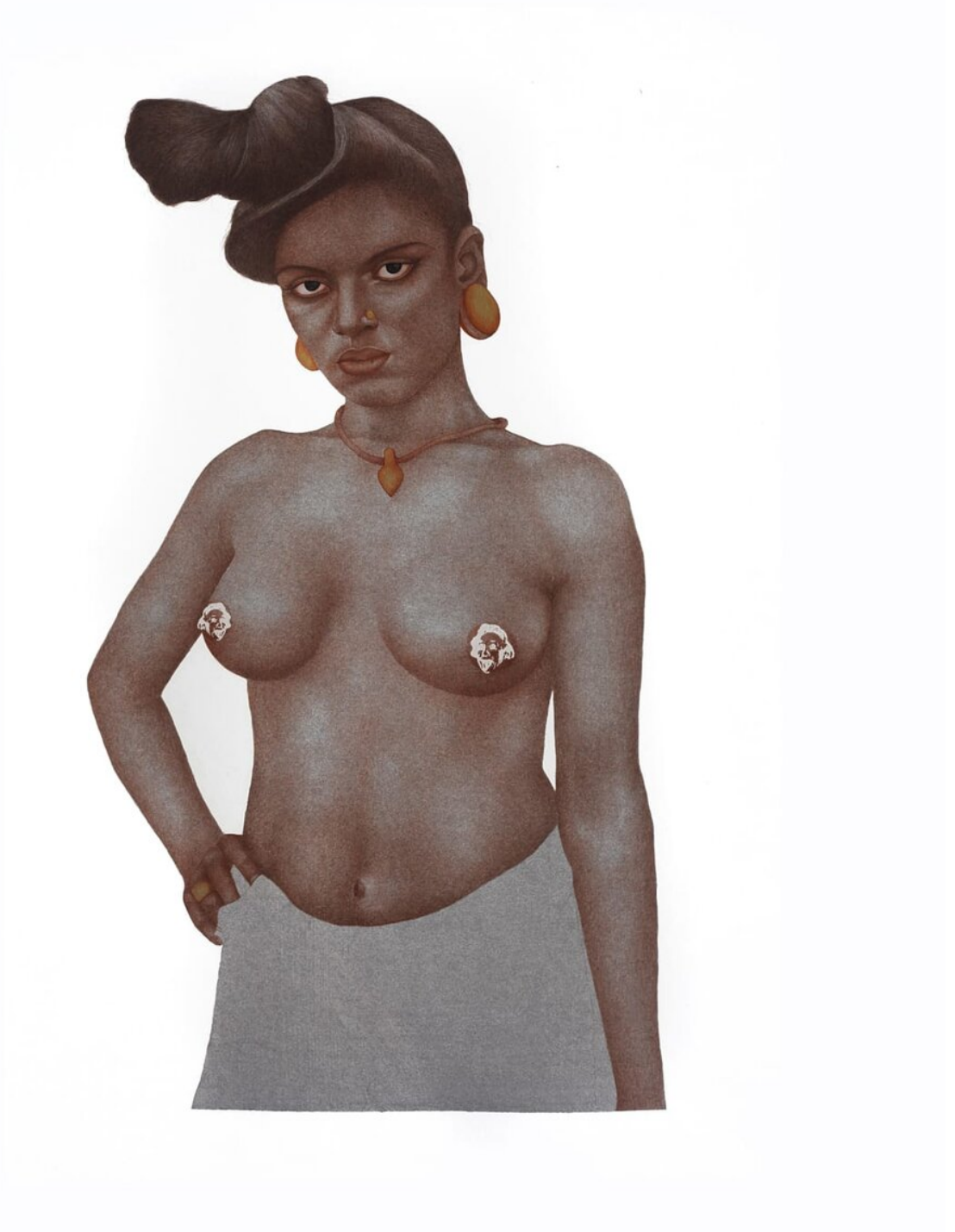
Muhammad Zeeshan, Nangeli 12 , 2021, Gouache on wasli and engraving on perspex, 97.8 x 73.7 cm, 38 1/2 x 29 in, Copyright The Artist