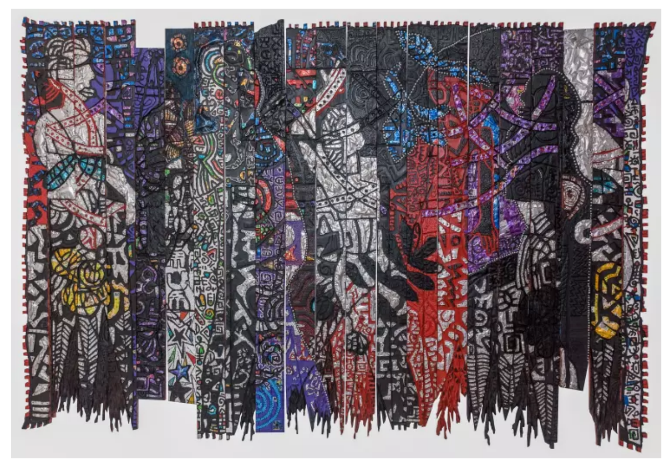
FLOWER GIRLS, 2021 | Mixed media on wood | 182.9 x 269.2 cm / 72 x 106 in

For many years, Chukwuma's practice has been deeply informed and inspired by the Uli art traditions of the Igbo people from southeastern Nigeria. However, through his research, the artist has discovered that Igbo culture has not been sufficiently documented, and as such, knowledge of their heritage is at risk of disappearing from contemporary consciousness. 'A lack of data is a big problem in Africa,' he says. 'I am creating works that I hope can become a form of documentation.' The Uli patterns and symbols were traditionally painted directly onto the skin or as murals on the walls of a house, which faded in the sunshine or washed away with the rain, but in Chukwuma's artworks they are made permanent through various artistic processes and embedded within a multitude of references.