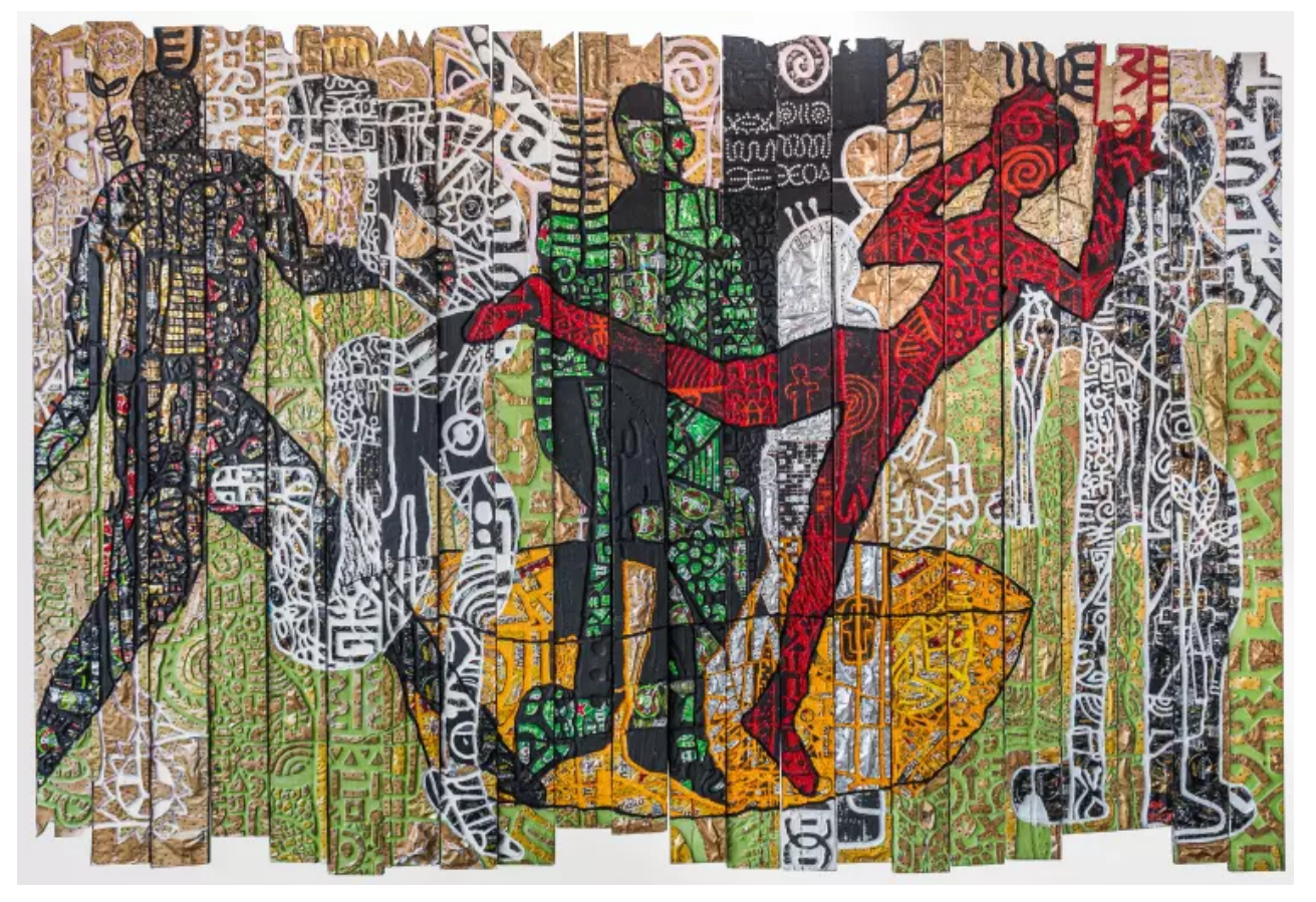
ROCK THE BOAT BABY, 2021 | Mixed media on wood | 182.9 x 297.2 cm / 72 x 117 in

Kristin Hjellegjerde Gallery, London Bridge, 2 Melior Place, SE1 3SZ