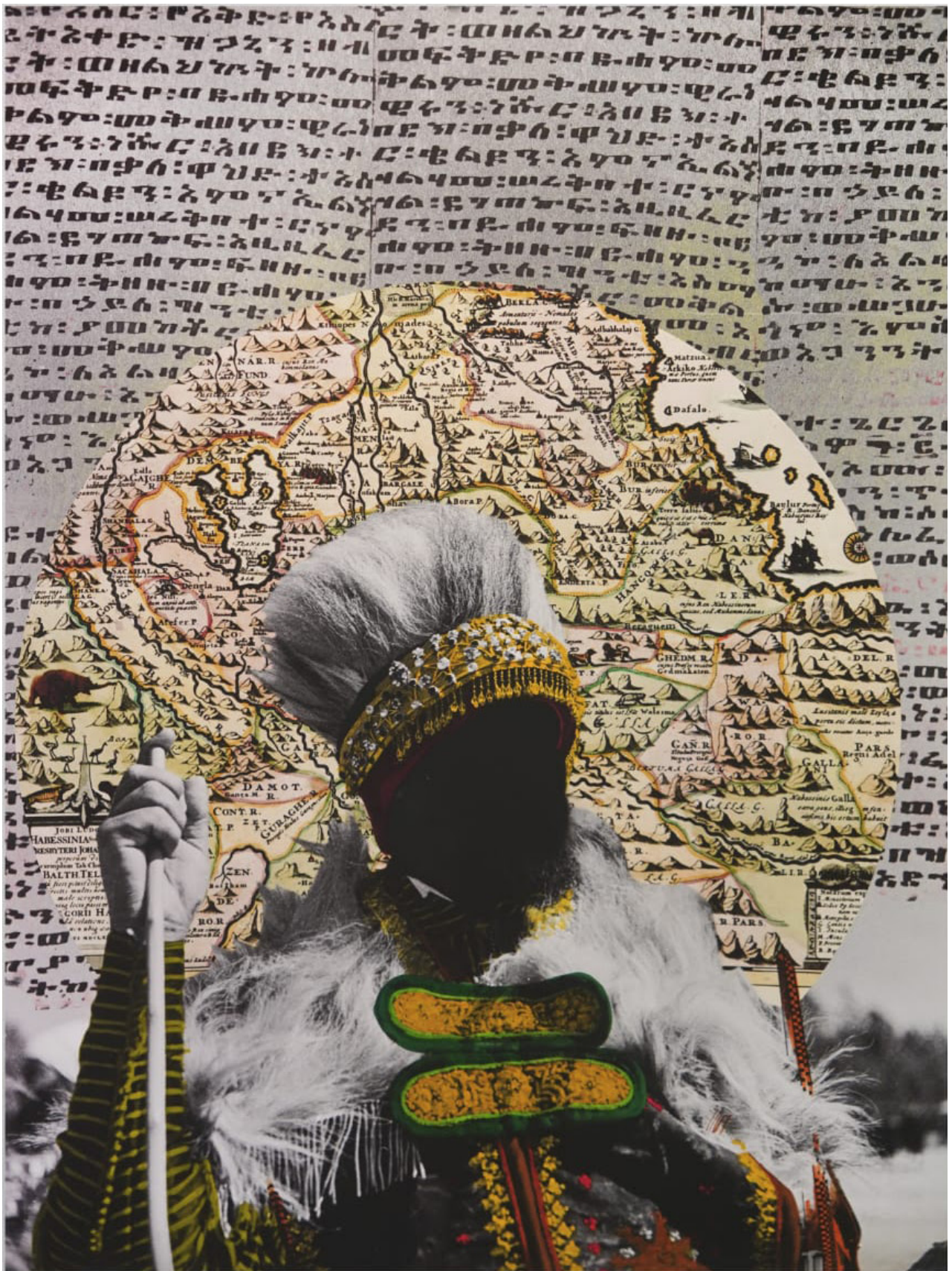
Wendimagegn Belete, Your Gaze Makes Me 8 , 2021. Print on matt photo paper, and artist-manipulated photograph, 180 x 130cm.

Belete began by increasing the scale of the portraits, some to life-size, before printing them out, overlaying fragments of text or maps by hand and applying transparent acrylic paints which deliberately allow the viewer to see through to the original image. The artist researched the colours of the costumes, many of which are still worn today, while other