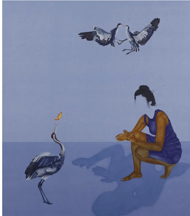
Rabia Farooqui - Deep Dive, 2021 • Gouache on Wasli • 76.2 x 63.5 cm

“Farooqui begins by photographing models in specific poses and gestures. These images inform the artist’s compositions in terms of both the bodily movements and the emotional experience as captured by the camera, but her painted figures are always faceless, or rather their faces appear transparent so that the background rises up to the surface. By anonymising her subjects, the artist purposefully draws our attention not only to the physical interactions taking place, but also to wider notions of performance and authority”