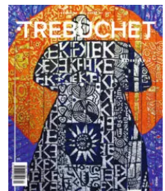
Trebuchet 10 Materials II